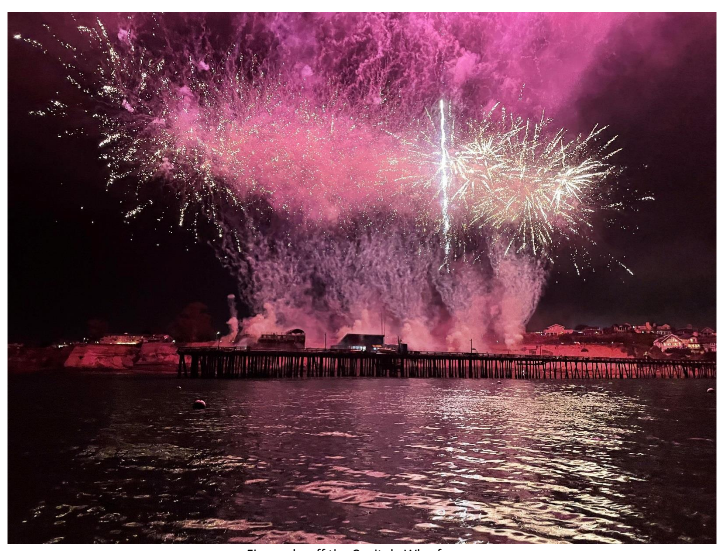
Fireworks off the Capitola Wharf