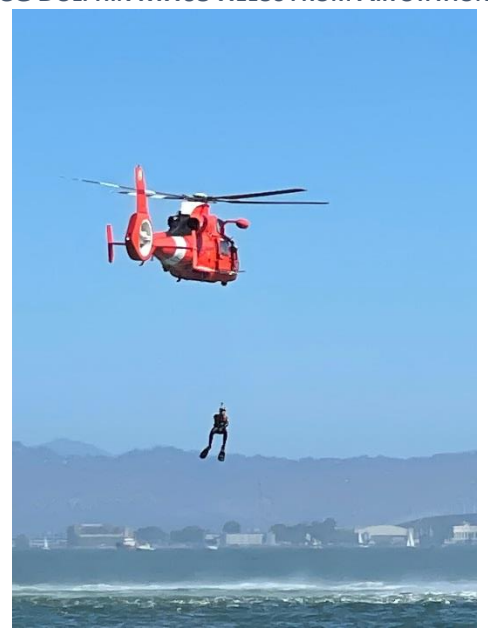
USCG Rescue Swimmer Demo