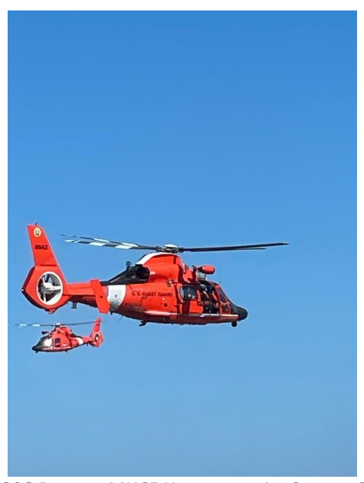
USCG DOLPHIN MH65 HELOS FROM AIR STATION SF