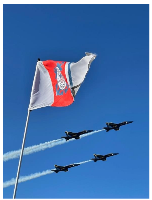
Blue Angels Flyby