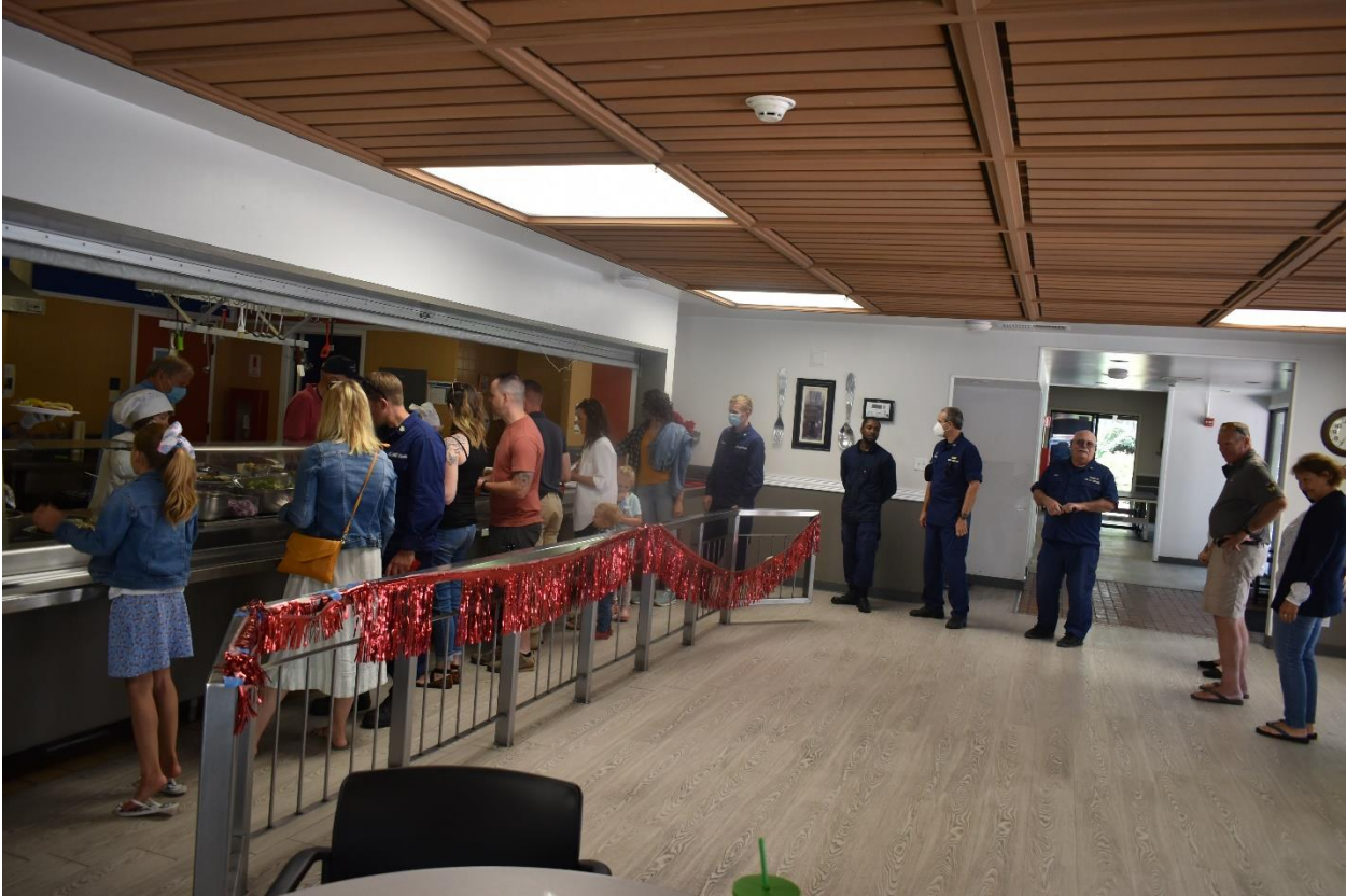
COASTIES AND FAMILIES WAITING IN LINE FOR GREAT FOOD