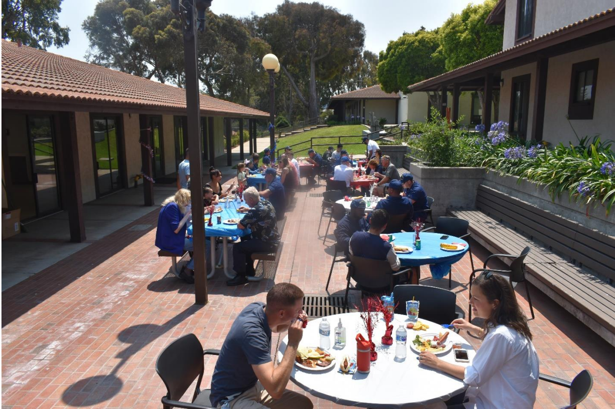
TEAM COAST GUARD ENJOYING A GREAT MEAL TOGETHER OUTDOORS