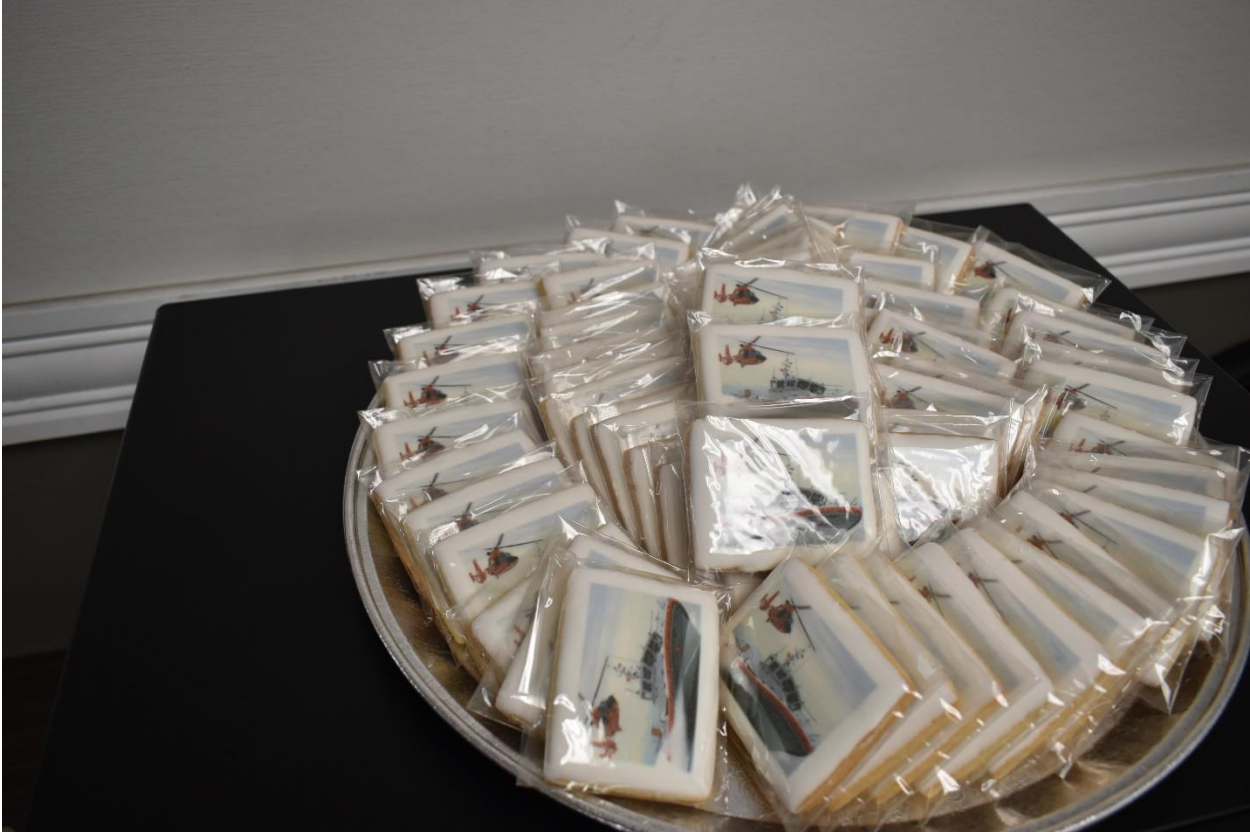
PICTURED COOKIES OF CG BOAT AND HELO