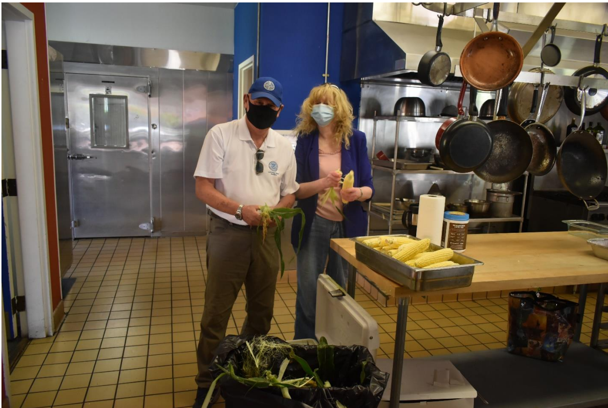
AUXILIARISTS HUSKING CORN