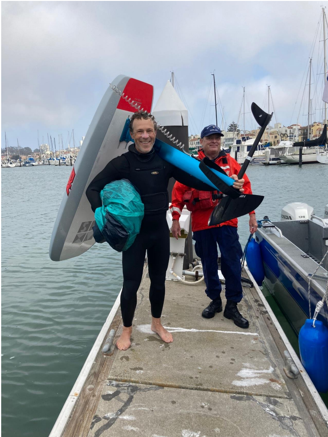
THE FACE OF THE KITE SURFER SAYS IT ALL. HE WAS SO APPRECIATIVE OF THE RESCUE. WE FELT PRETTY GOOD AS WELL...