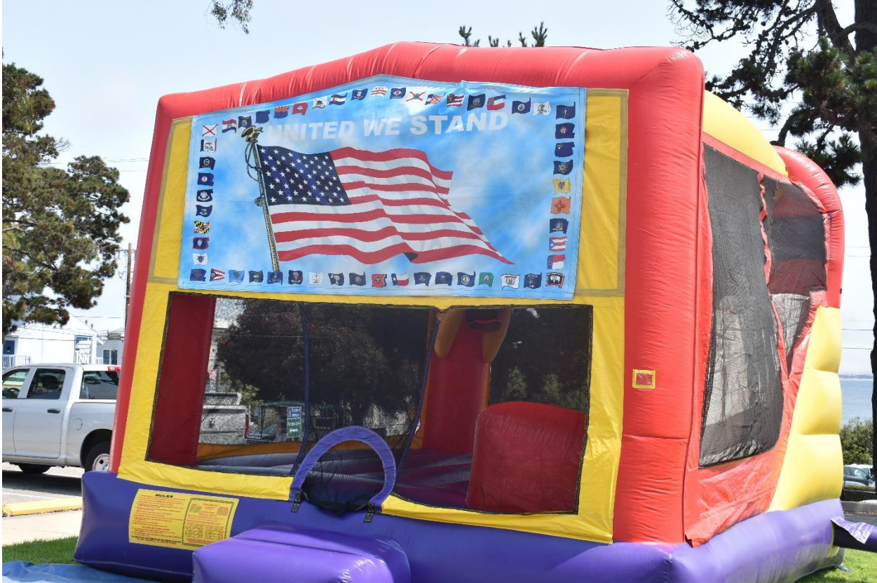
JUMP HOUSE FOR THE KIDS