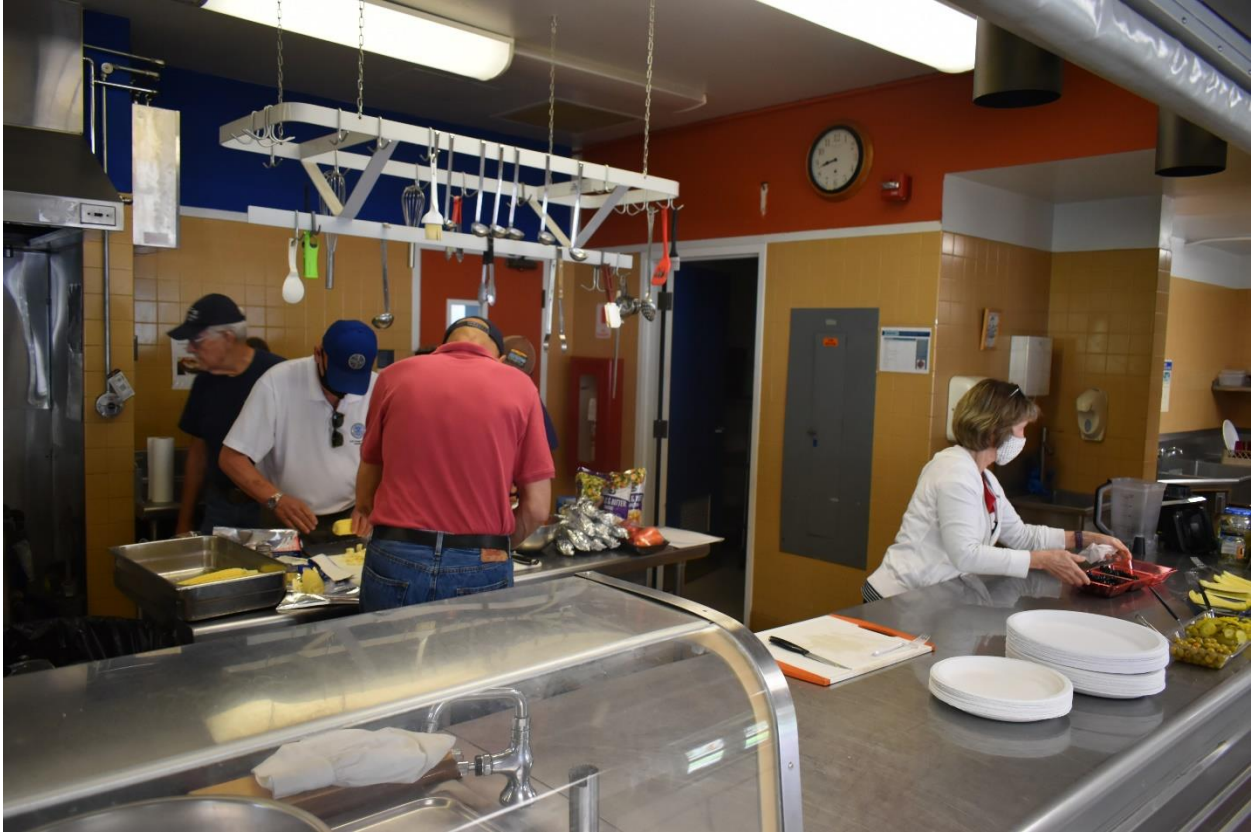
DIVISION 6 AUXILIARISTS PREPARING FOOD FOR BBQ