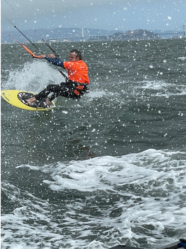
FIGURE 5 - THIS IS WHERE THE KITESURFER USES OUR WAKE AS A TAKE-OFF PLATFORM. AND YES, IT DOES GET BETTER.