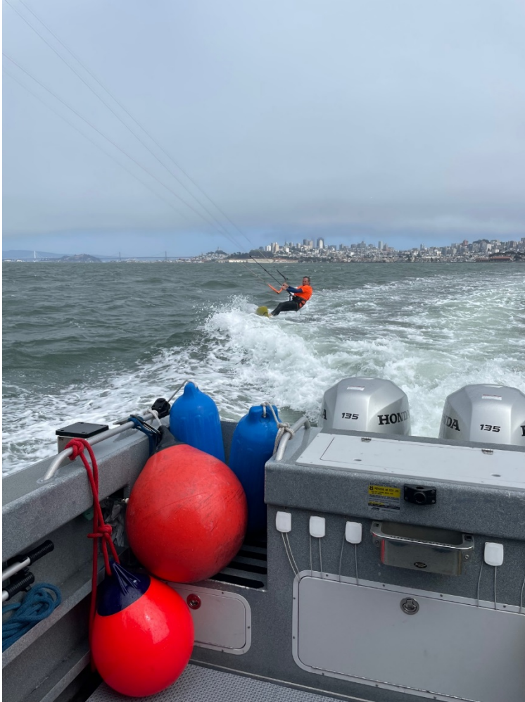
FIGURE 4 - KITESURFER COMES OUT TO GREET US ON MOST PATROLS TO THANK US FOR OUR EFFORT. WAIT, IT GETS BETTER.