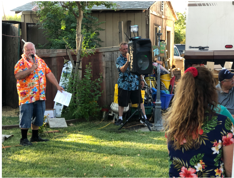
thanks members heat and showing up