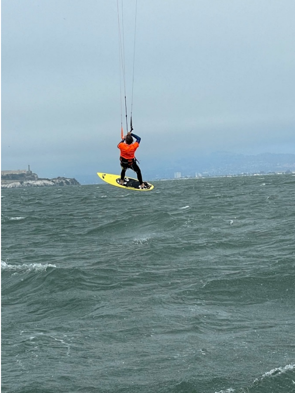
FIGURE 6 - THIS WAS ON HIS WAY TO ABOUT 50+' OF AIR. HE ALWAYS LANDS GRACEFULLY AND THEN HEADS BACK TO CRISSY FIELD.