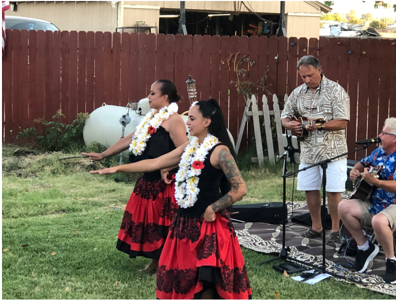
Above and music by and Friends