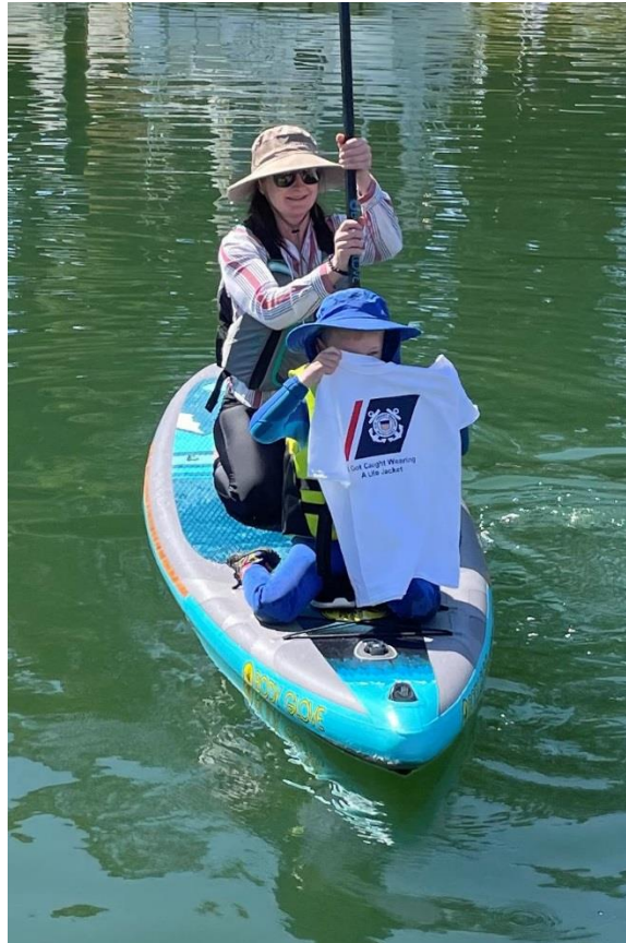
Happy “kid” ... Happy Mom! Mission Accomplished!