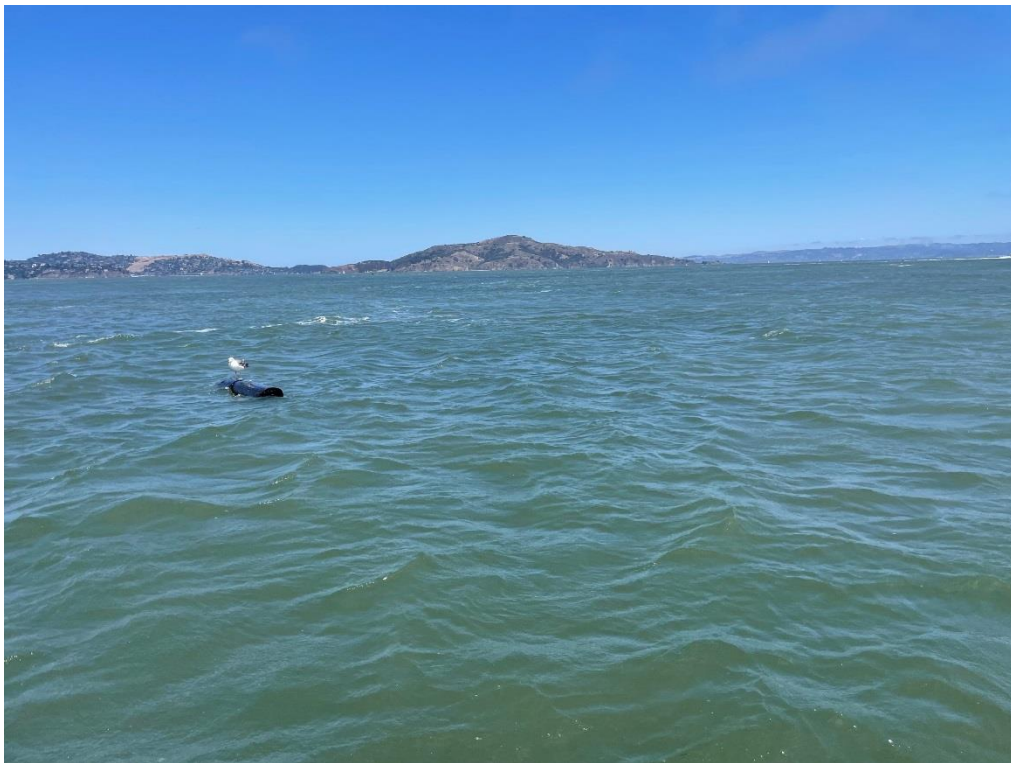
FIGURE 3 - - 5' TO 7' PIECE OF TELEPHONE POLE FLOATING NEAR GOLDEN GATE BRIDGE.