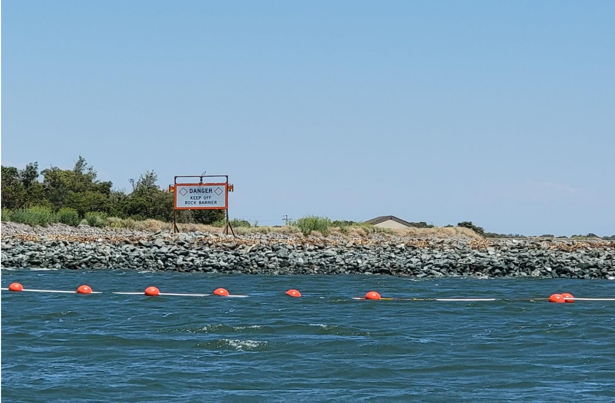
A picture showing barrier Buoys and warning sign on False River Temporary Rock Dam