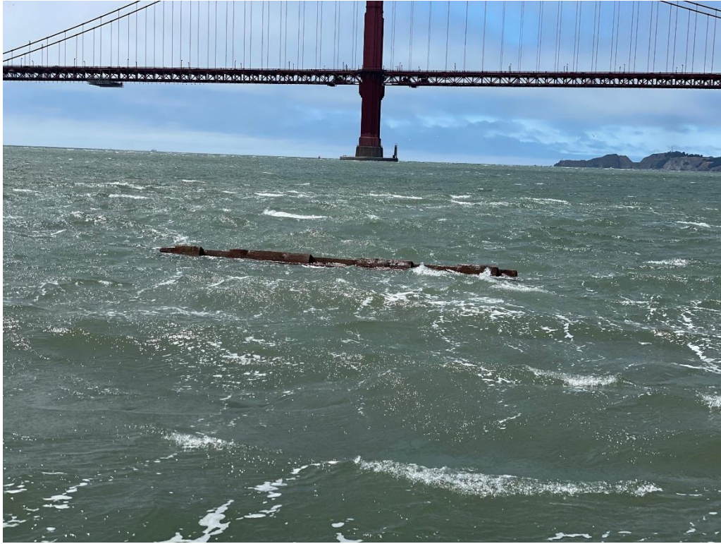
FIGURE 2 – FLOATING STRUCTURAL WOODEN BEAM APPROXIMATELY 25' IN LENGTH.