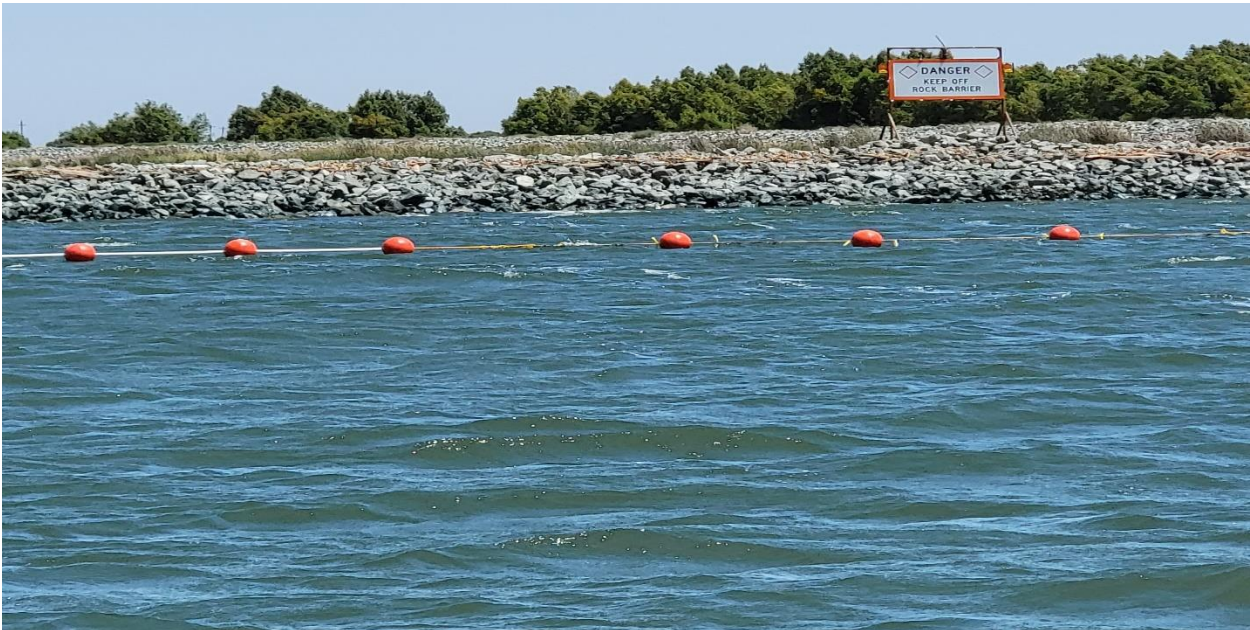
A picture showing barrier Buoys and warning sign on False River Temporary Rock Dam