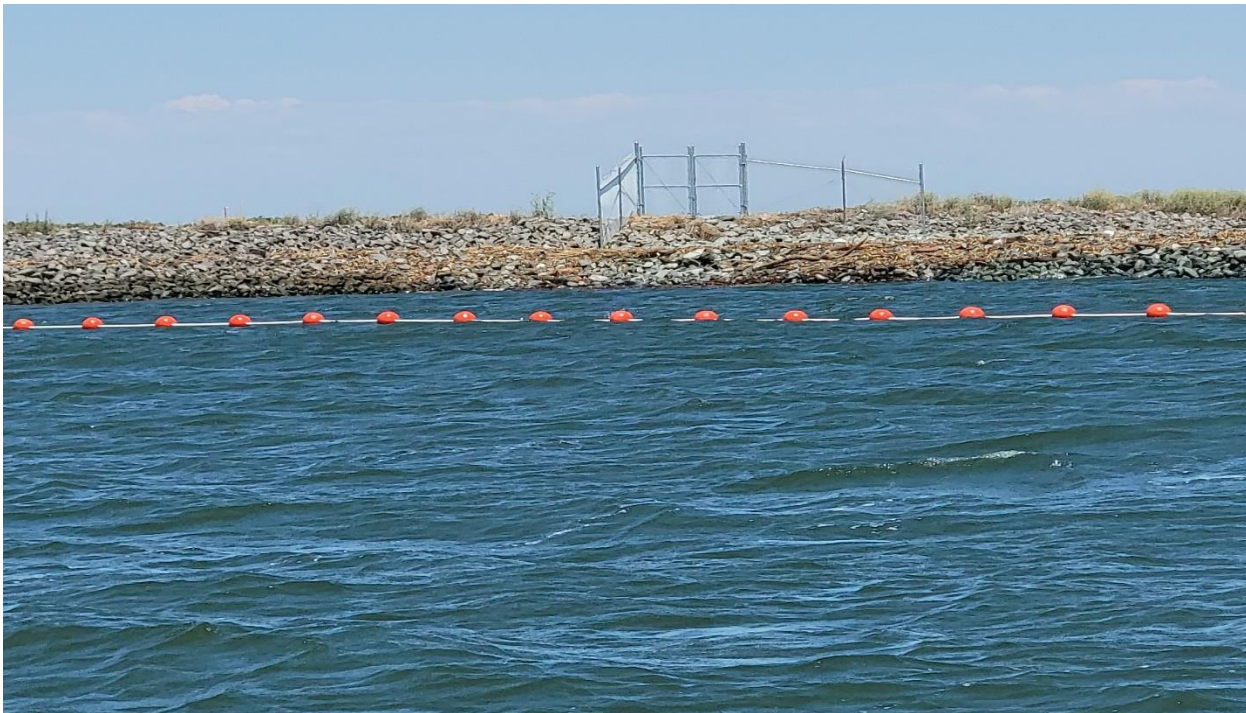
A picture showing barrier Buoys and warning sign on False River Temporary Rock Dam