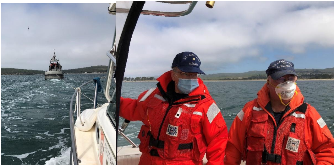
Aux Vessel Margarita in Long tow with Station Bodega Bay Surf Boat 47245