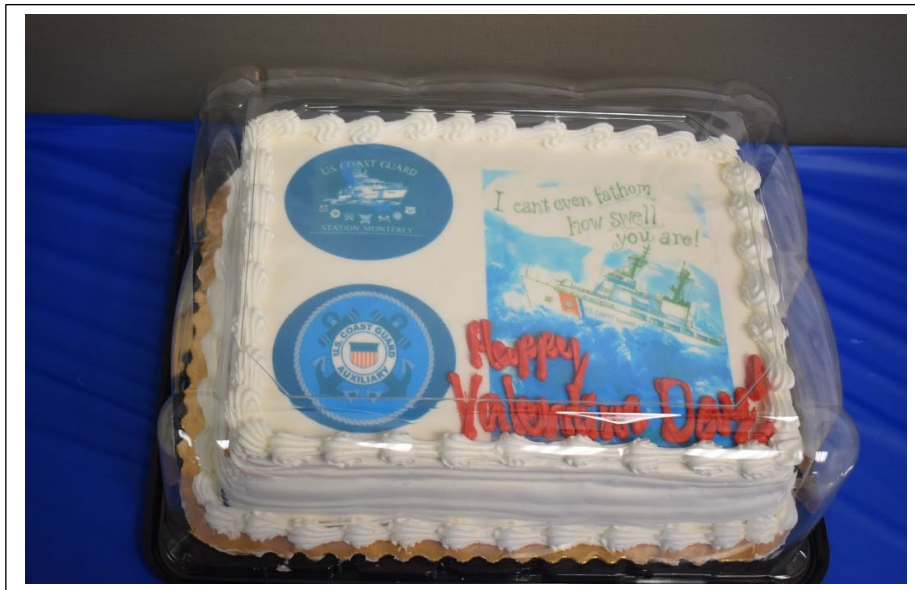
No event is complete without a cake. Besides the Happy Valentine's Day greeting, the cake displays a cutter in heavy seas and reads " I can't even fathom how swell you are! " Coast Guard Auxiliary humor at its best (?)