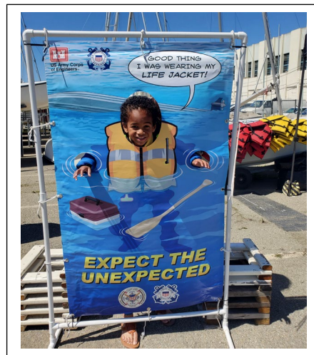
Kids of all ages delighted in the life jacket photo stand.