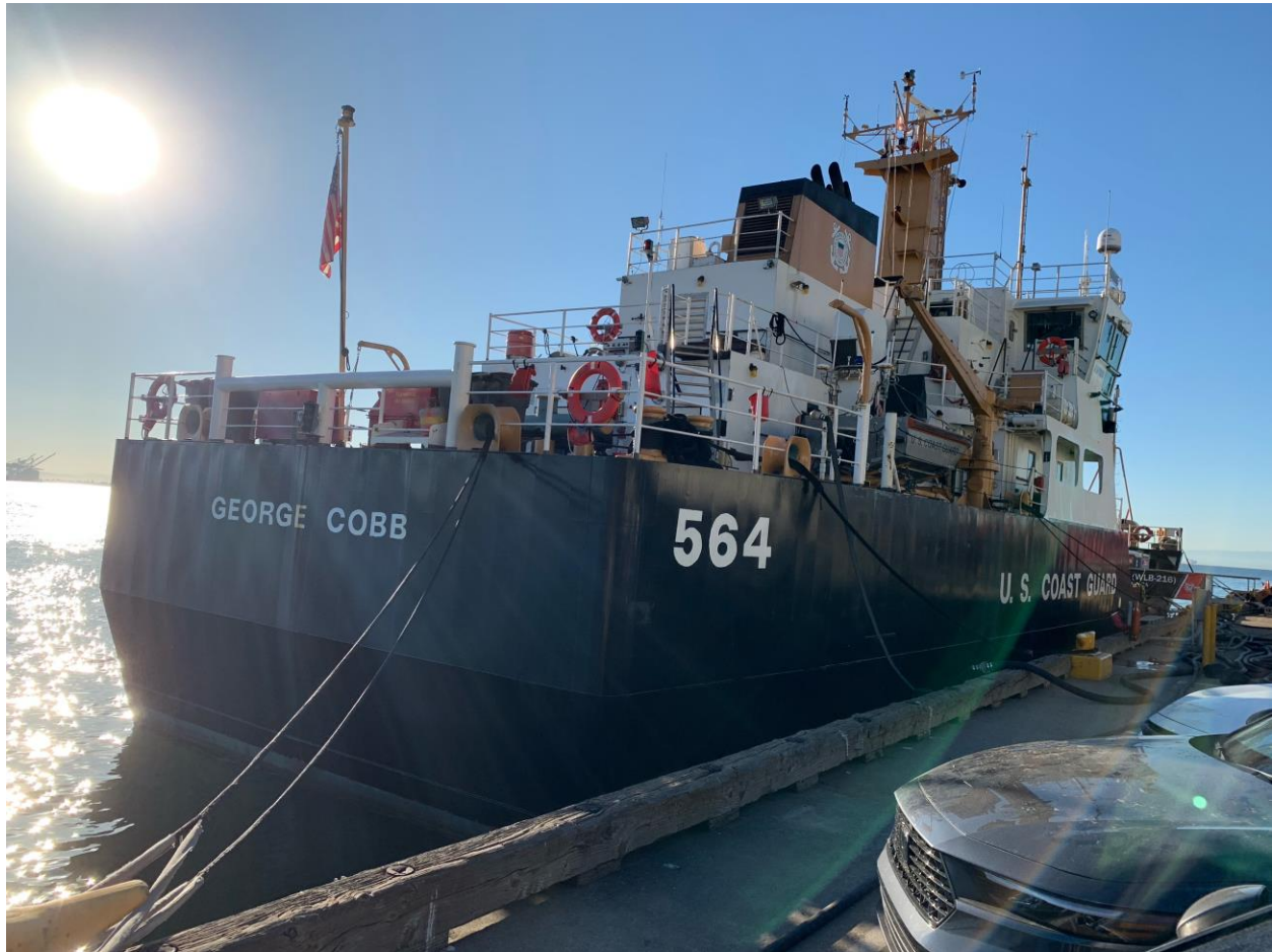
Cutter George Cobb Fleet Week San Francisco Bay Oct 6th Fleet Week 2023.