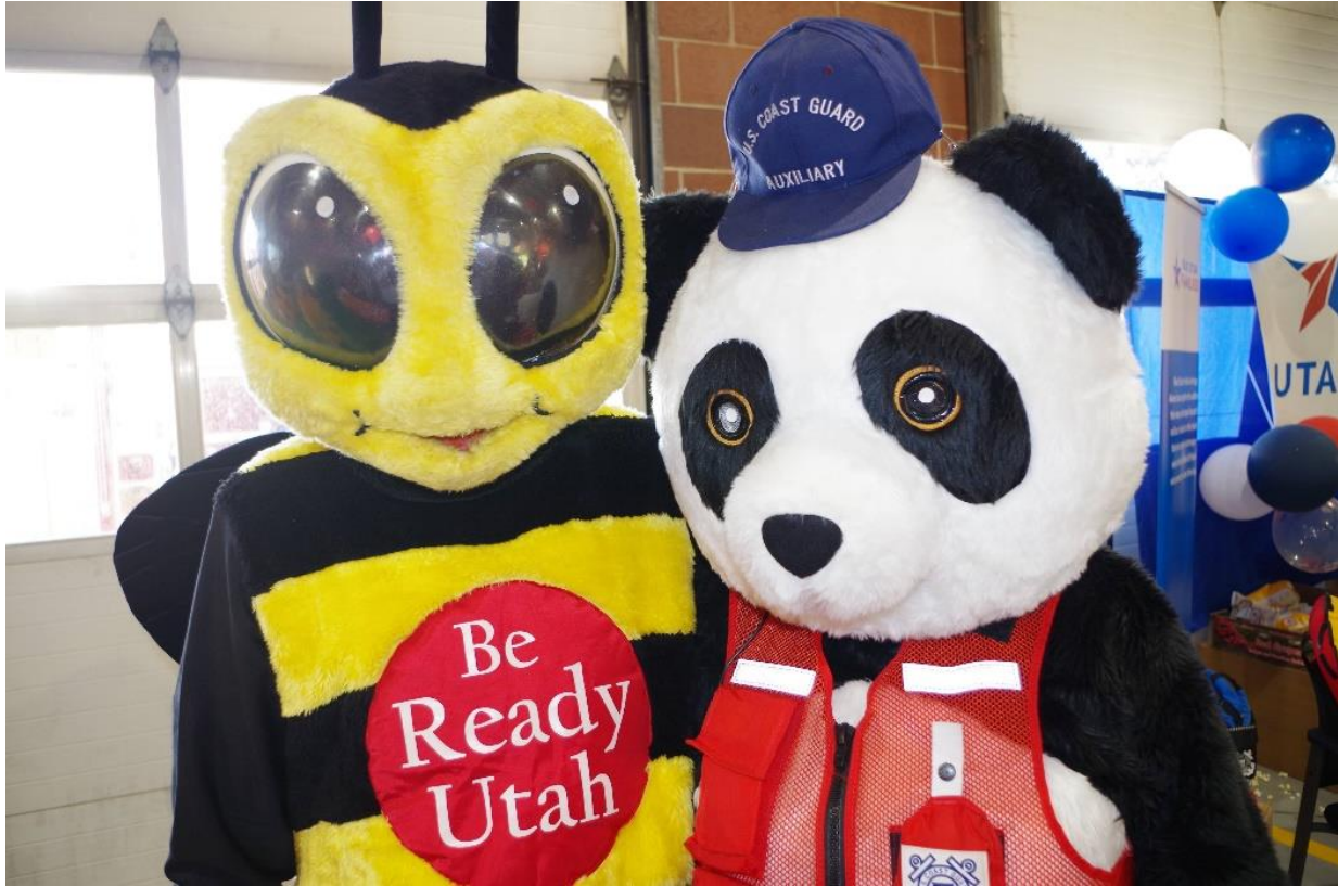
LAYTON, UTAH - PANDORA PANDA WITH FELLOW MASCOT BE READY UTAH BEE FROM THE UTAH DIVISION OF EMERGENCY MANAGEMENT. SEPTEMBER 27, 2023.