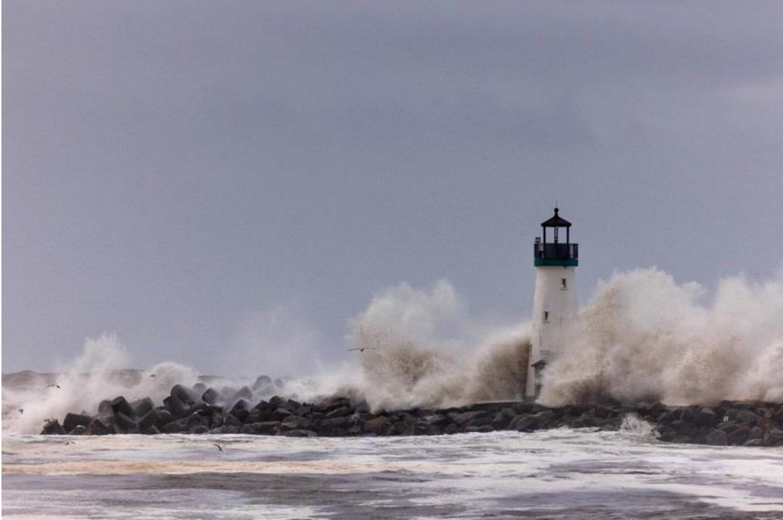
Santa Cruz Harbor West Jetty – New Year's Day 2023