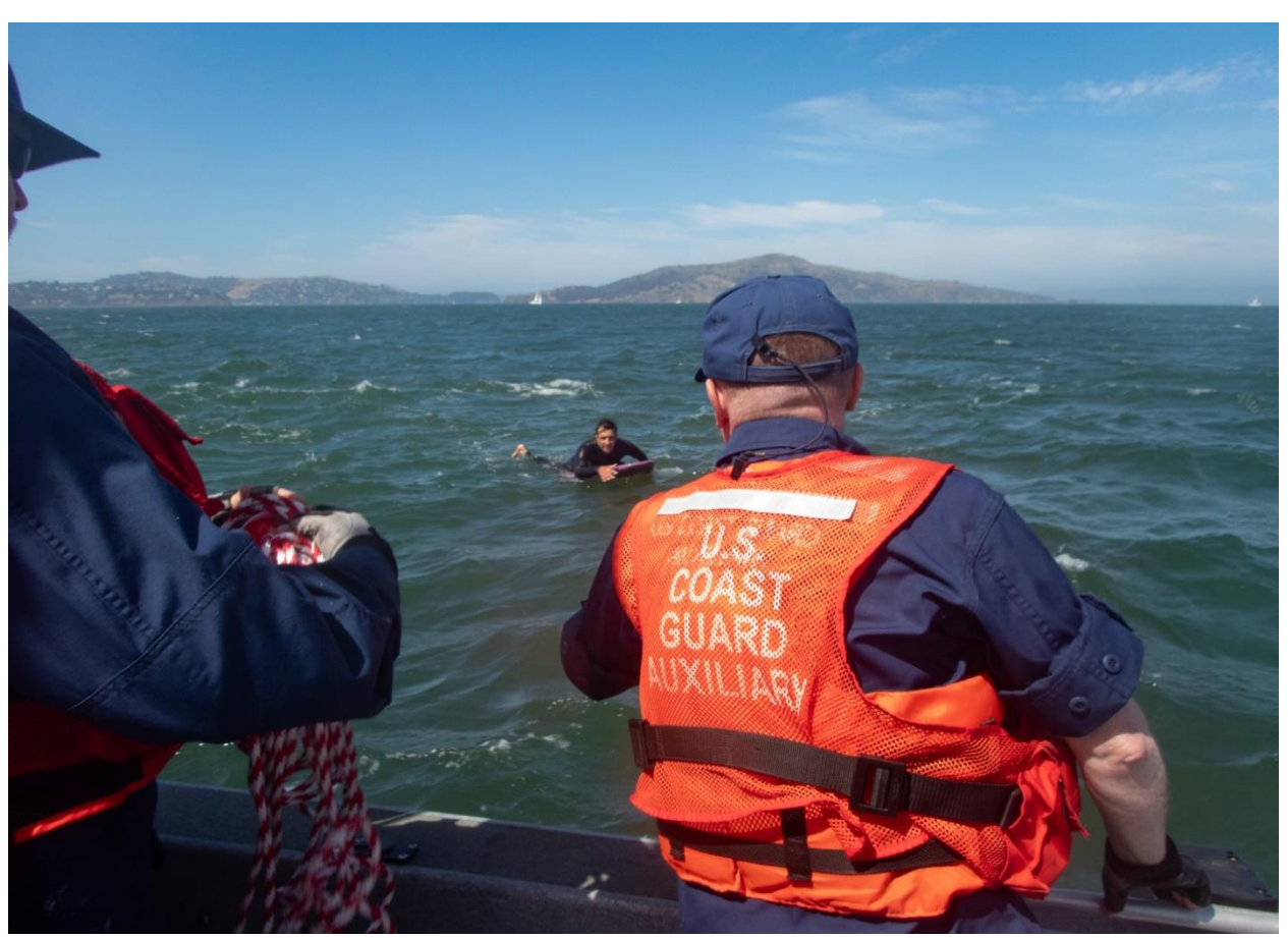
This SAR case with subsequent kite surfer saved represents the 10th successful SAR case with a person saved.

At approximately 1503, channel 16 traffic from Blue & Gold Fleet's tour boat GOLDEN BEAR had the windsurfer in sight. SERVANT arrived approximately 5 minutes later to recover the windsurfer. The windsurfer and his board were brought on board. The windsurfer had suffered equipment failure and lost his wing in the wind and thus had no propulsion to return to shore. He was in good physical condition with no injuries or evident hypothermia. The windsurfer was transported to Saint Francis Yacht Club at 1514 for disembarkation.