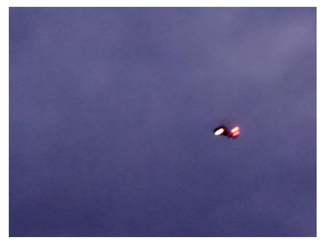
Night Helo OPS with Station Vallejo - 6/22