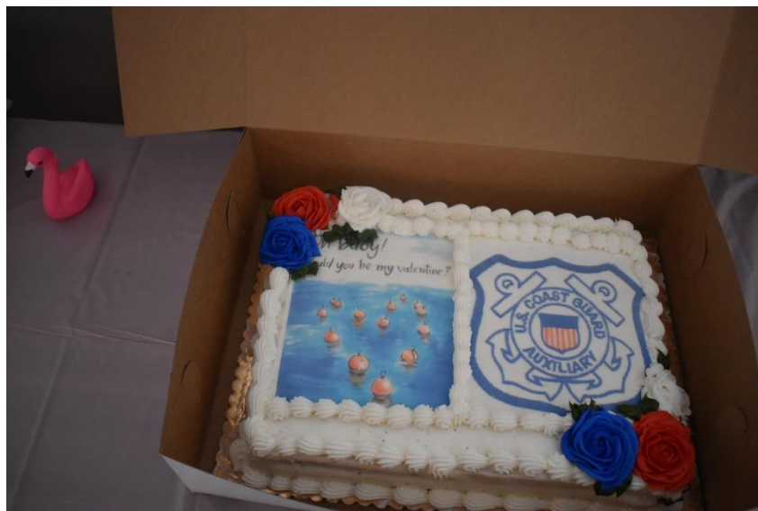
Valentines desert for the Valentines Party