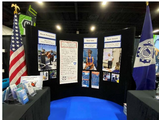
SANDY, UTAH - DIVISION 7 BOOTH FOR 2023 UTAH BOAT SHOW AT THE MOUNTAIN AMERICA EXPO CENTER. FEBRUARY 9, 2023.