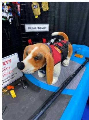
SANDY, UTAH - OUR SHOW MASCOT SHOWS OFF HIS DOGGY LIFE JACKET. FEBRUARY 9, 2023.