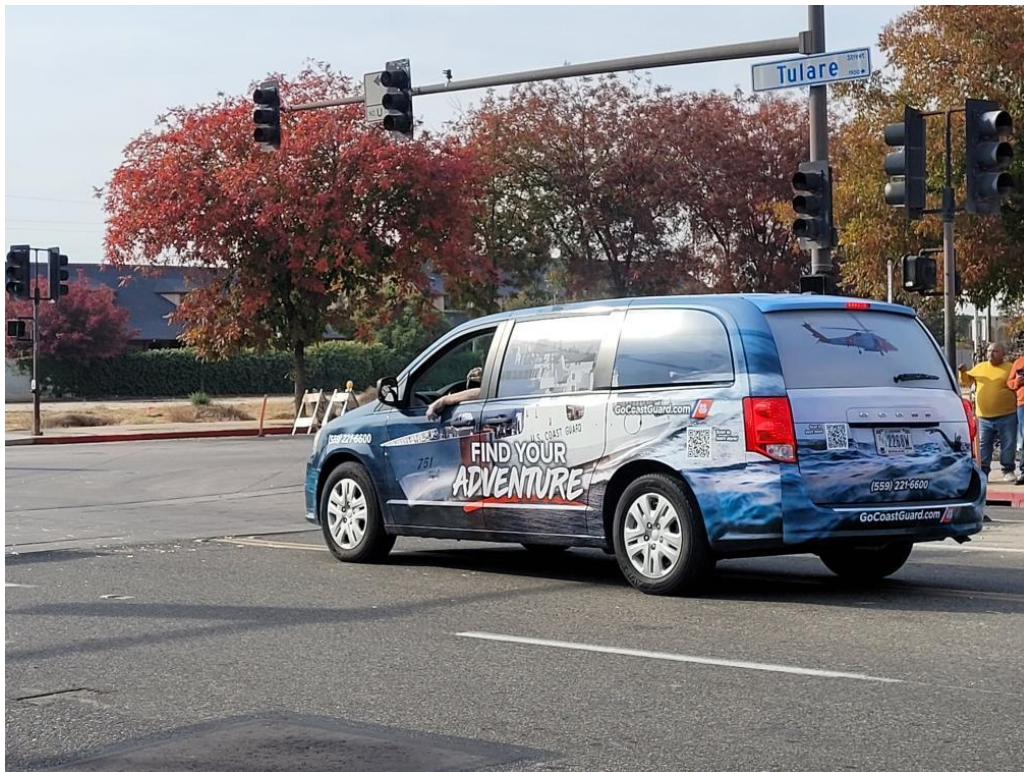
2022 FRESNO VETERAN'S PARADE/ CG VAN RECRUITING OFFICE