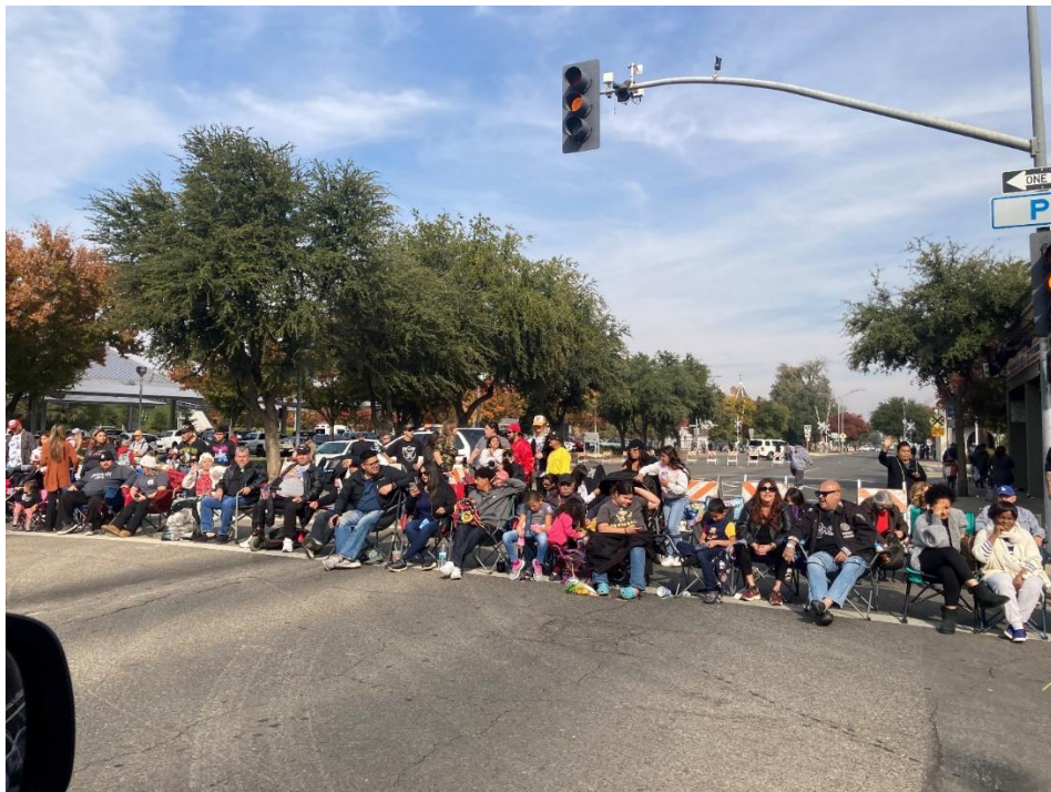
2022 FRESNO VETERAN'S PARADE SPECTATORS