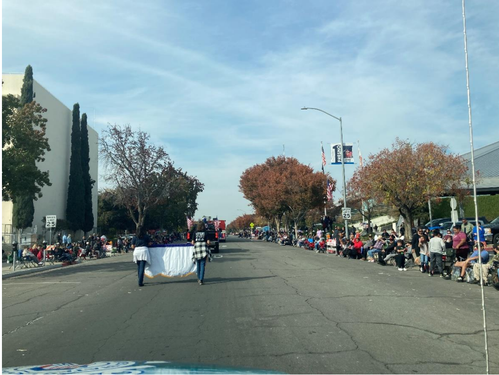
2022 FRESNO VETERAN'S PARADE SPECTATORS