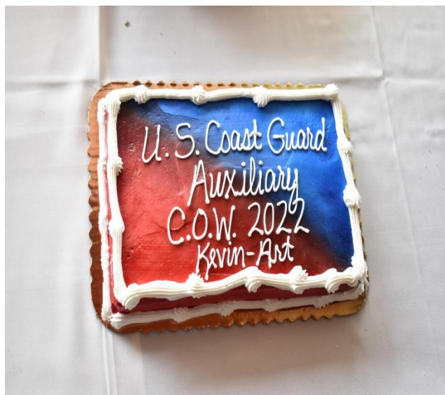
Special Change of Watch Cake