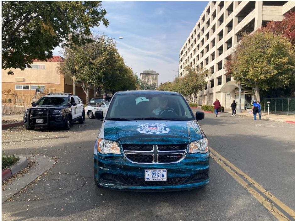
2022 FRESNO VETERAN'S PARADE, CG RECRUITING VAN/ DONALD PIERCE DRIVING