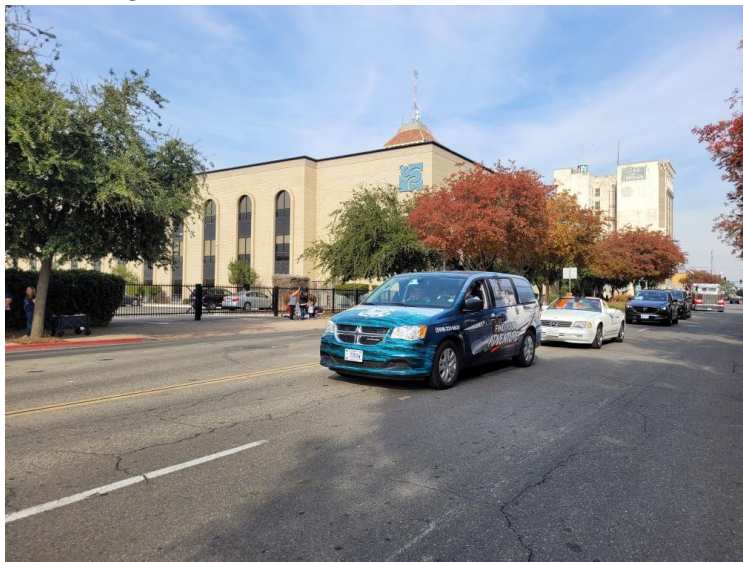
2022 FRESNO VETERAN'S PARADE/COAST GUARD RECRUITING VAN DRIVEN BY FLOTILLA 10-05

Attached are pictures from Sanger and Fresno Veteran's Parades.