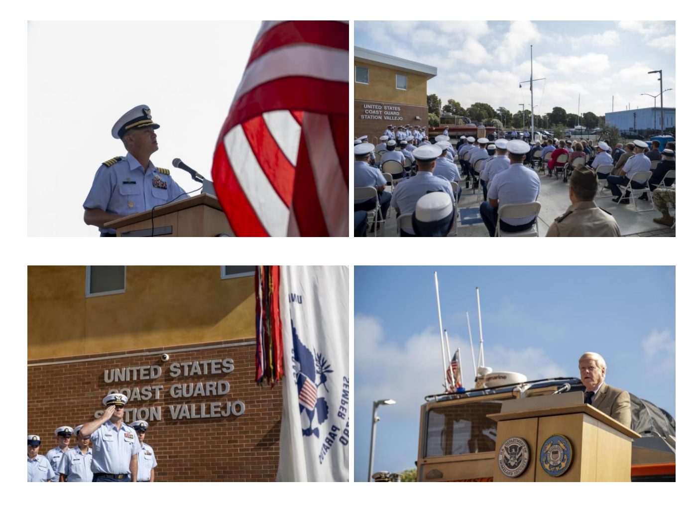
Vallejo Calif 9.16.22 USCG District 11