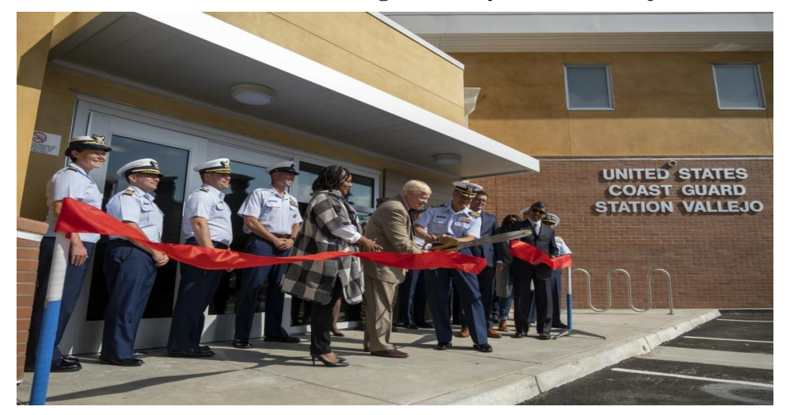
Coast Guard holds ribbon cutting ceremony for new Vallejo search and rescue