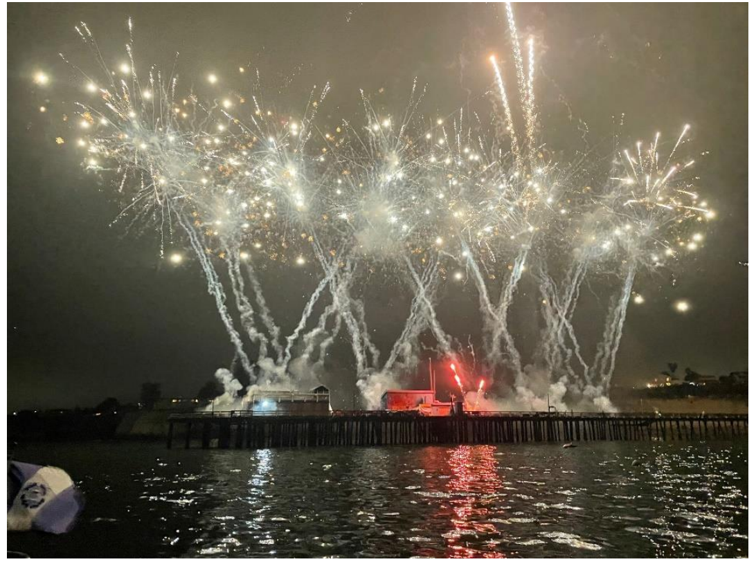
As fog lingered in the area, the show proceeded and was thoroughly enjoyed by all!