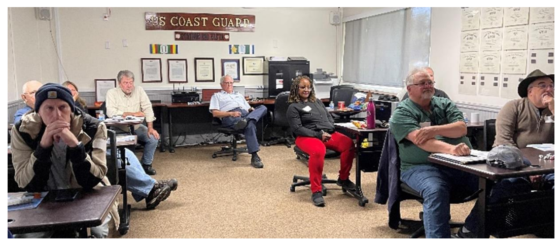
Station Rio Vista – Boat America Class graduates 8 boaters May 7<sup>th</sup>. Students listen intently during Boat America course at USCG Station Rio Vista by Instructors from Div 5 and 3. TEAM WORK – THAT'S WHAT IT'S ALL ABOUT