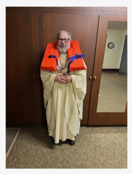
LIFE SAVING CLERGY