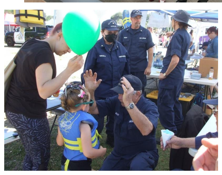
Free Life Jackets for Children #1

Free Life Jackets for Children #2 (Signed release on file)