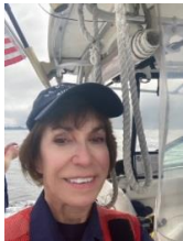
District Staff Officer - Public Affairs