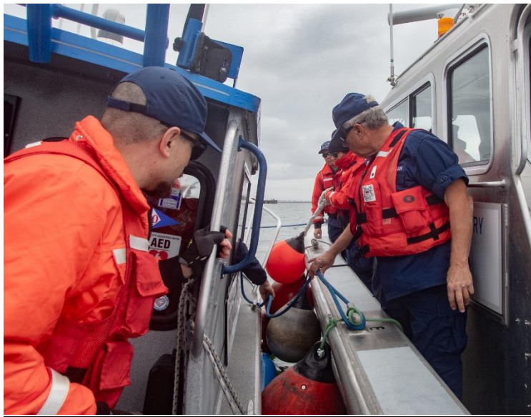
Side tow with SILVER CHARM and SERVANT.