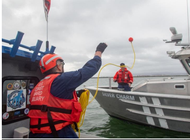
Side tow with SILVER CHARM and SERVANT with heaving line toss by Adam Kovalevsky.