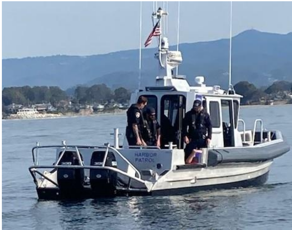
The Harbor Patrol Boat with most of Oscar on board!

Santa Cruz Harbor has obtained a new Patrol Boat ... a 33-footer made by Moose Boats. The Harbor Patrol got some "Oscar" practice in as well on their new vessel.