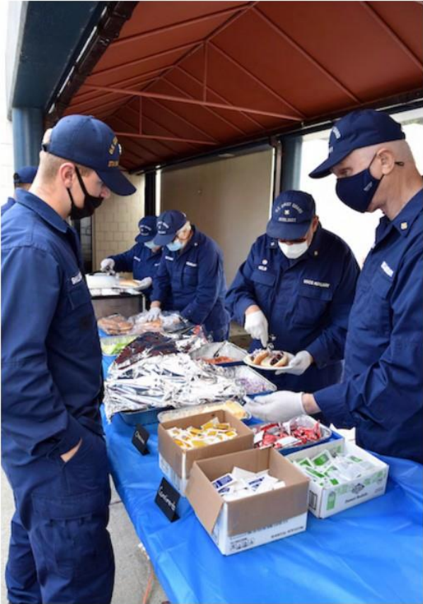
JANUARY 2022 WINNER: Yerba Buena Island, Calif – Auxiliarists who complete AUXCA (Auxiliary Culinary Assistant) training can augment the active duty in a variety of ways. Here, District 11 Culinary Assistance staff are serving active duty personnel on October 23, 2021 at U.S. Coast Guard Sector San Francisco.