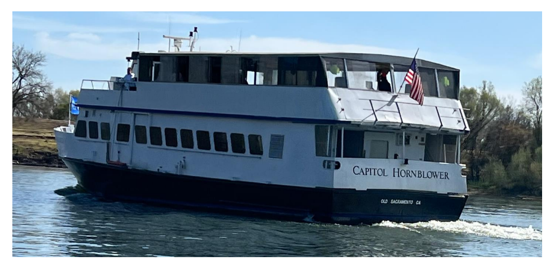
CAPITAL HORNBLOWER underway.

So was this nothing, a family assisted, or a life saved. For the crew of the facility, it didn't really matter. They all felt great that they had made the waterway safer.