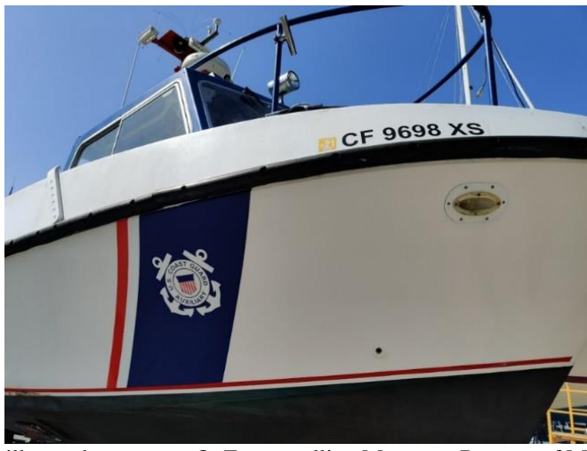
Division 6 will soon have a new OpFac patrolling Monterey Bay out of Moss Landing. DOLPHIN DREAMS is a former Coast Guard 32PWB (Ports & Waterways Boat).

New Facility arriving in Moss Landing – Soon!