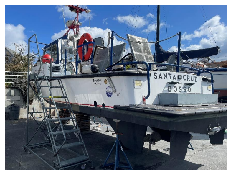
The new name will soon be adorning DOLPHIN DREAMS. In the photo above, she is undergoing maintenance in the Santa Cruz Harbor Boatyard.