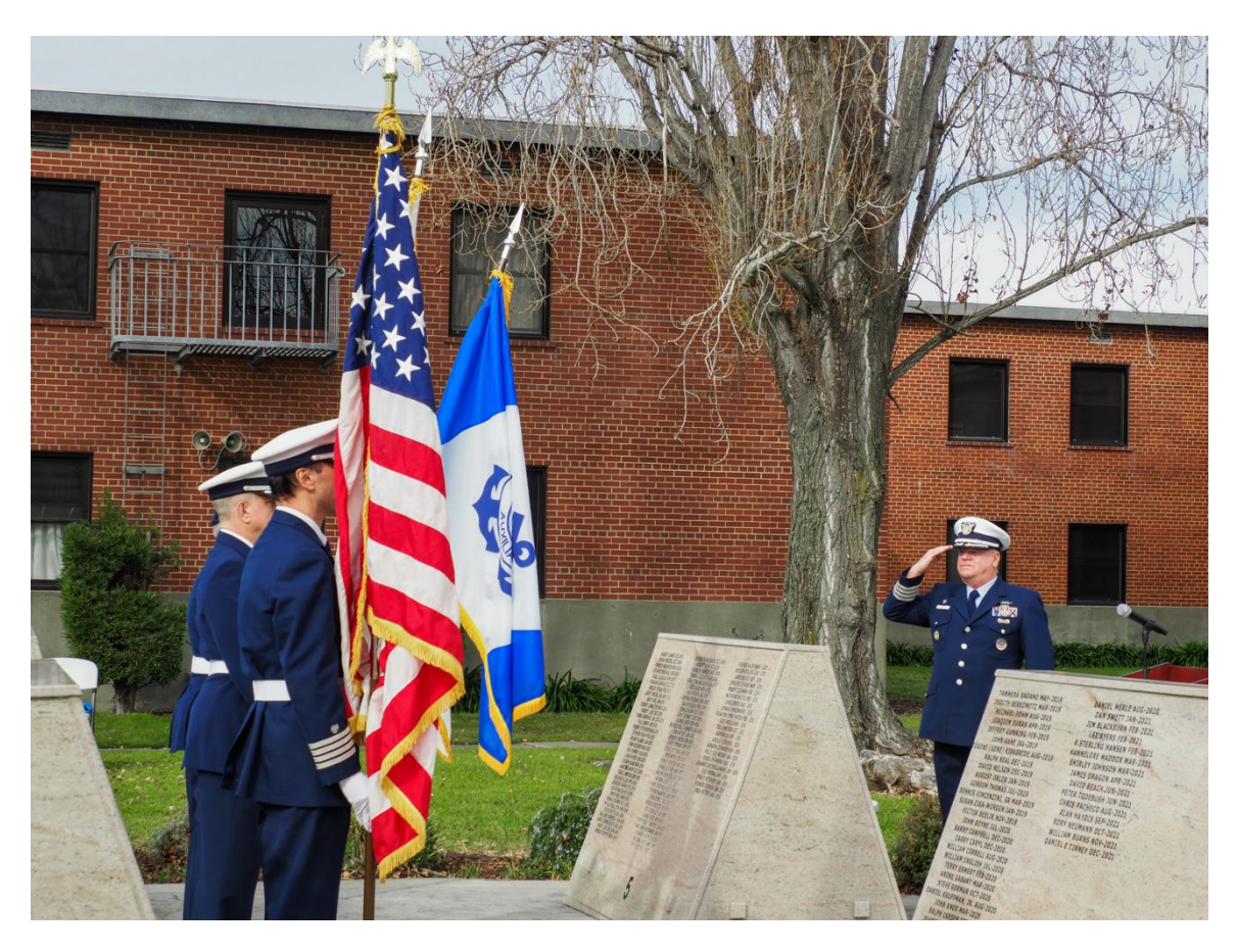
Figure 4 D11NR Color Guard posting Colors at the Aux Memorial Ceremony.