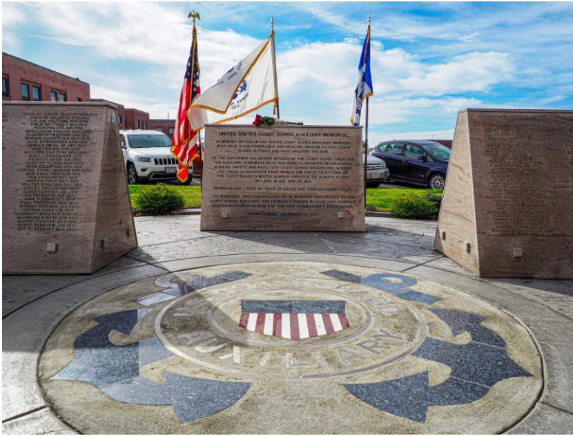
District 11 Northern Memorial