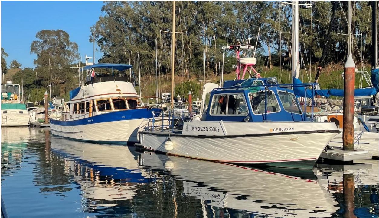
07 February, Santa Cruz Harbor: The “new” Sea Scouts vessel STRING O’PEARLS moored aft of the “old” Sea Scouts vessel BOSSO.