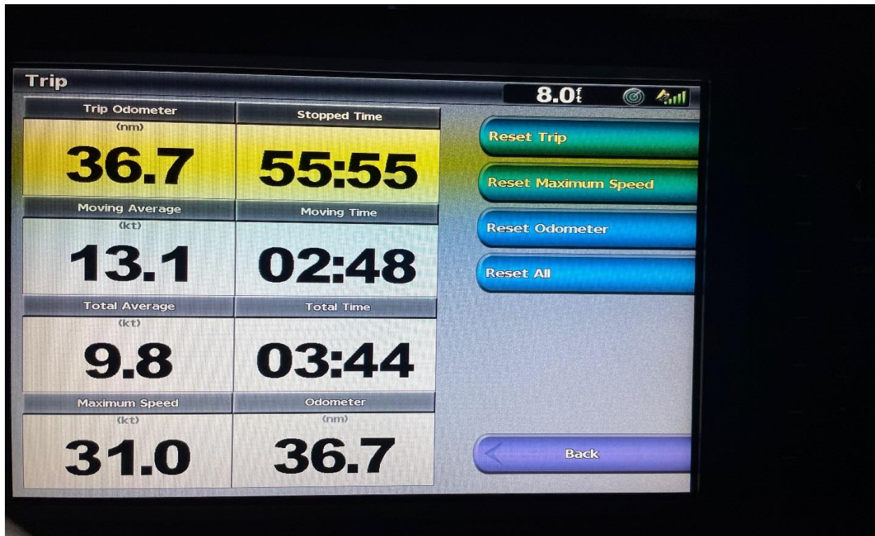
FIGURE 2 PERFORMANCE MEASURES FOR THE DAY