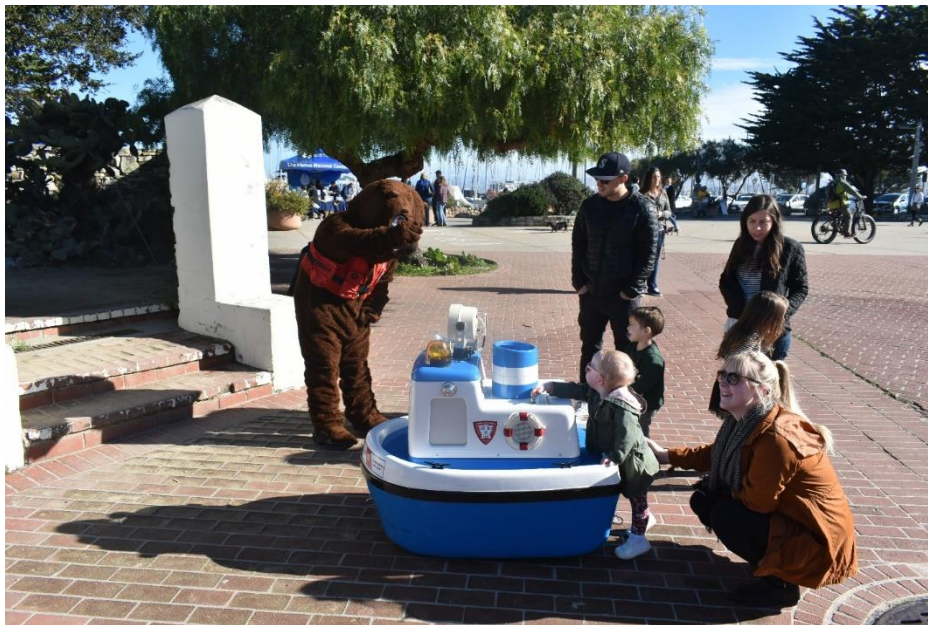
FIGURE 4 AXTTER AT COASTIE AT WORK