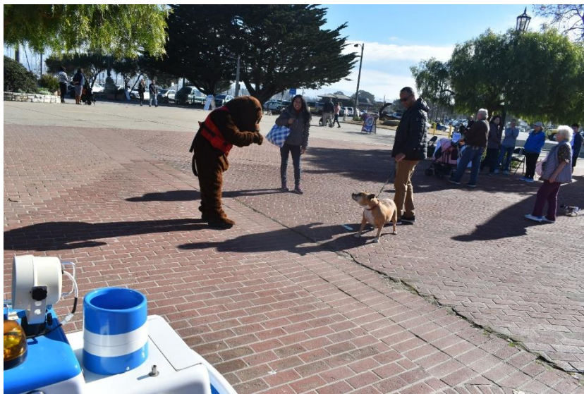
FIGURE 8 EVEN DOGS LOVE AUXTTER