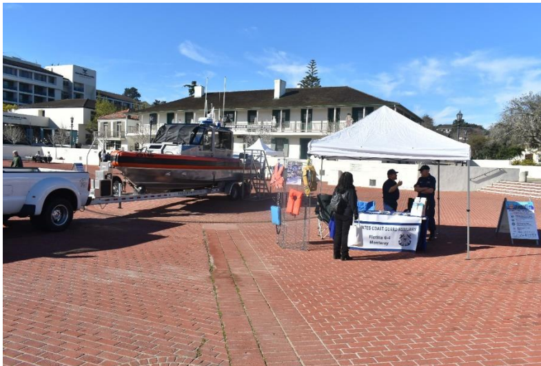
FIGURE 1 DISPLAY AT CUSTOM HOUSE PLAZA