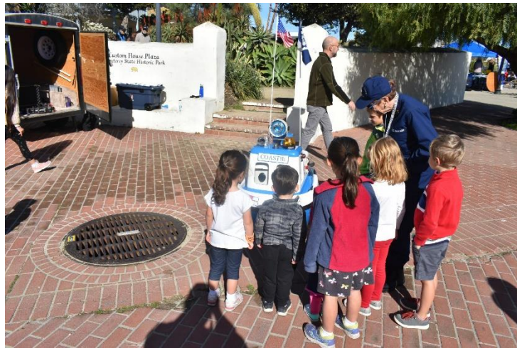
FIGURE 11 KIDS VISITING COASTIE