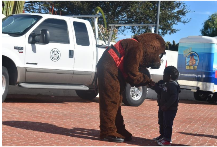
FIGURE 13 KIDS WITH AUXTTER