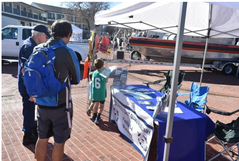
FIGURE 2 VISITORS TO OUR BOOTH