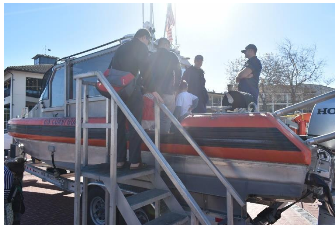
FIGURE 9 VISITORS TO THE 29 RBS