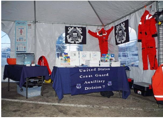
Division 7 Indoor Expo booth