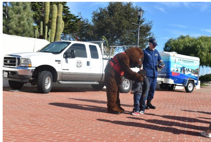
FIGURE 12 AXTTER AND FRIEND