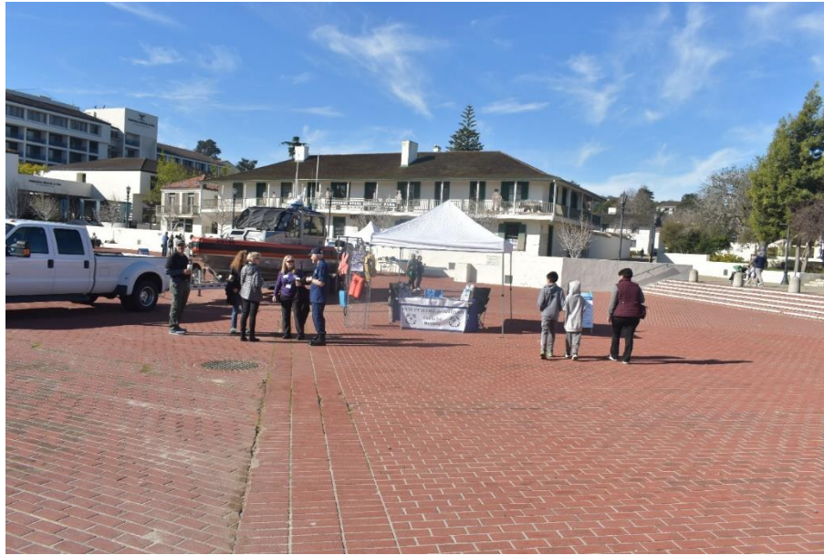
FIGURE 3 VIEW OF SETUP AT PLAZA