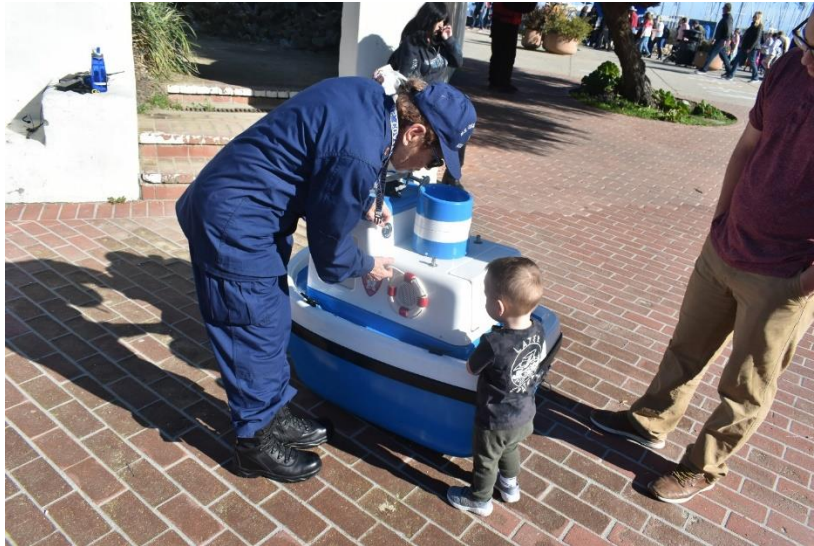
FIGURE 5 CHILD VISITOR TO COASTIE