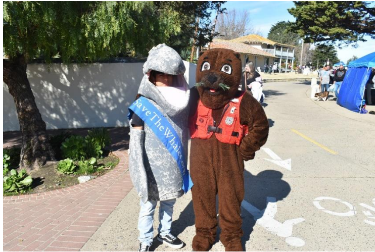
FIGURE 10 AXTTER AND FRIEND