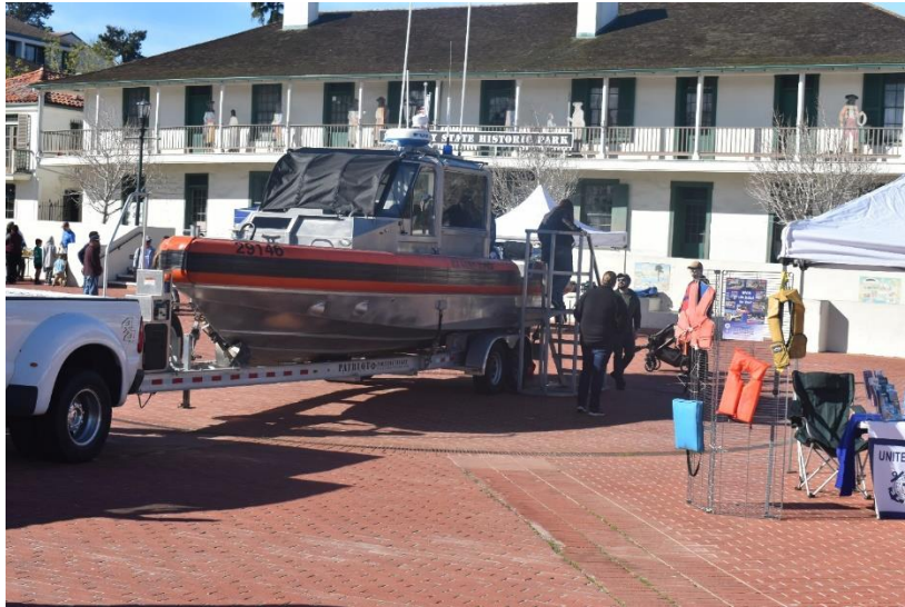
FIGURE 7 29RBS STATIC DISPLAY