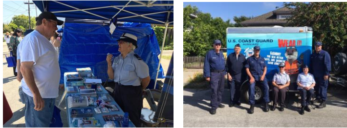
Flotilla 12-01 at the San Leandro Cherry Festival