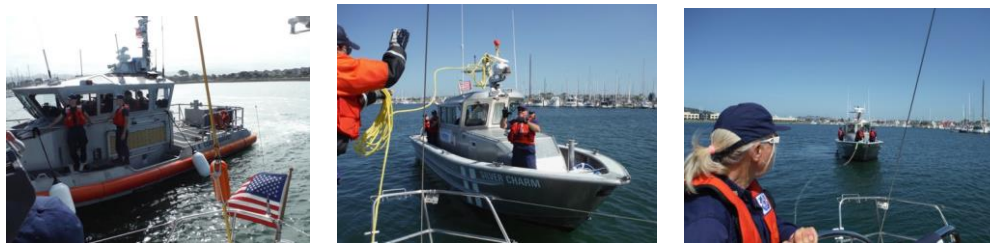
Victory OPTRE 21 and 22 June