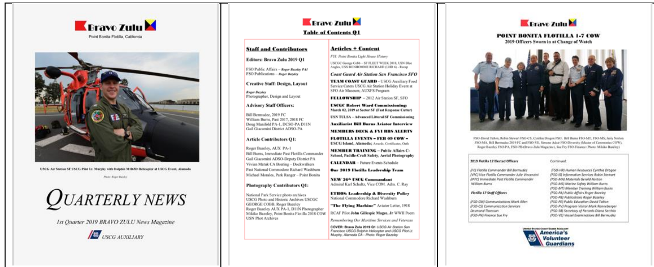
Bravo Zulu 2019 Q1 Cover, Contents Page, and Flotilla 1-7 COW 2019 New Leadership Team

Completed and Published Bravo Zulu 2019 Q1 Flotilla 1-7 Magazine