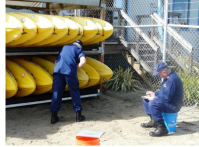
VSC's Being Done