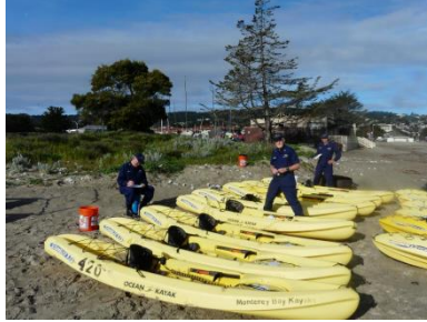
VSC at Monterey Kayaks