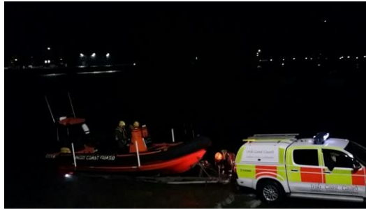
Launching into the Dingle Harbor