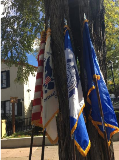
Flags of our Honor Guard