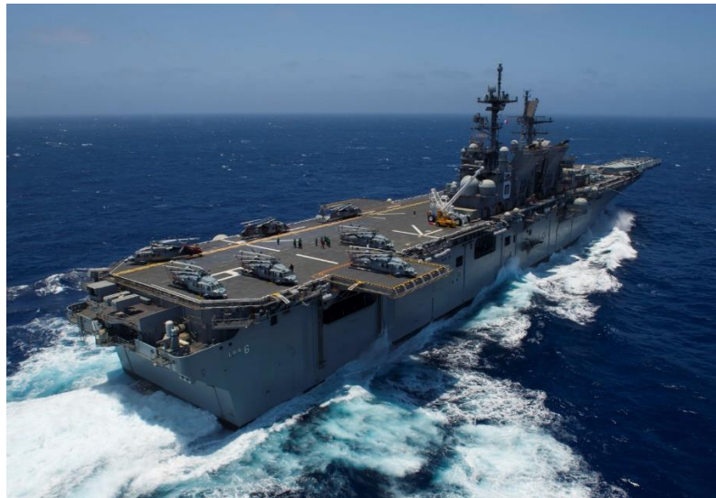
The amphibious assault ship USS America (LHA 6) conducts flight operations while underway to Rim of the Pacific (RIMPAC) 2016.

USS AMERICA (LHA-6) Returns to San Francisco for Fleet Week 2018 By Roger Bazeley