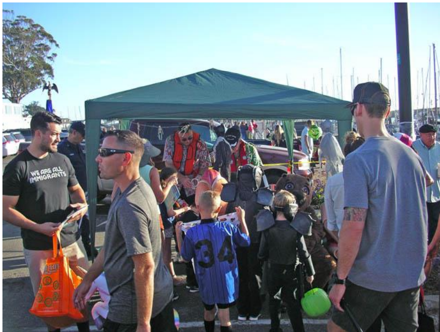
At times, the Santa Cruz Haunted Harbor event was a mob scene with over 400 children and their parents visiting Flotilla 67's boating safety booth in a three hour period. Meanwhile Flotilla 6-10 members and members of other D11NR divisions (including Auxiliary members who are medical