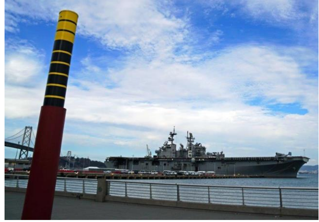
USS America (LHA-6) Arrives- docks for 2018 SF Fleet Week

“The America Class ships are built by Northrop Grumman Shipbuilding.”