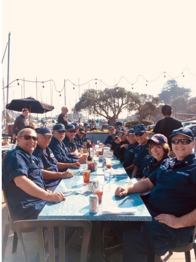
Division 6 Coxswains and Crew taking a midday break for lunch