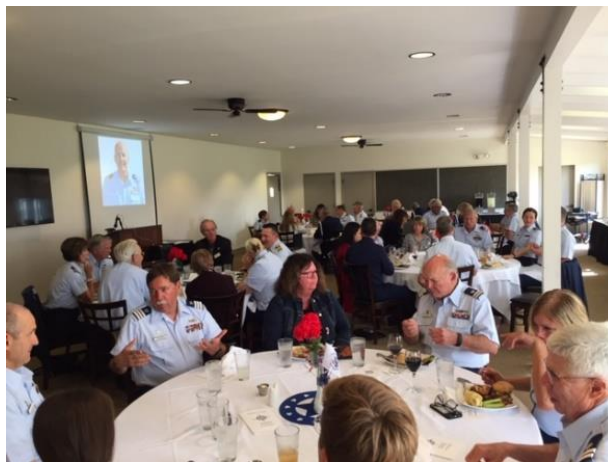
Division 6 Team Coast Guard Change of Watch!

Team Coast Guard Change of Watch, on Saturday, November 10 th at the Bayonet and Blackhorse Golf Club House.