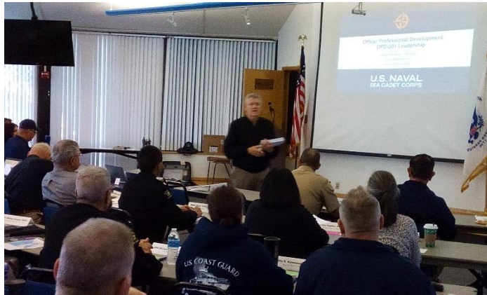
Instructor chatting about the class

The training started at 0900 to 1400hrs.