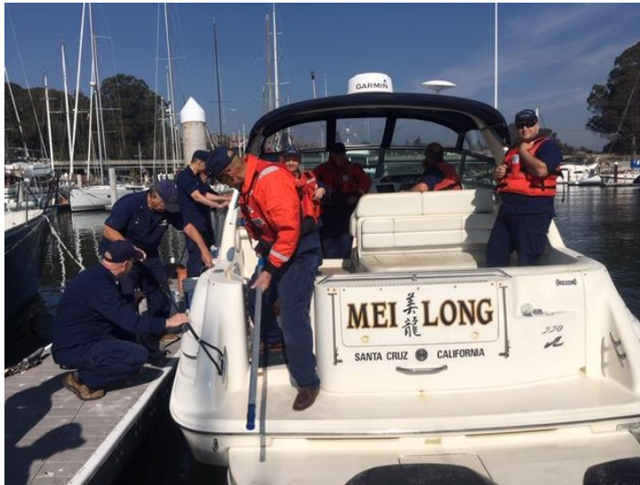
522/Mei Long docking for lunch break, crew from both 522 and 219 handling lines

Three Boats (219, 522, 616) with 16 Auxiliarists - all but one were Division 6 Members