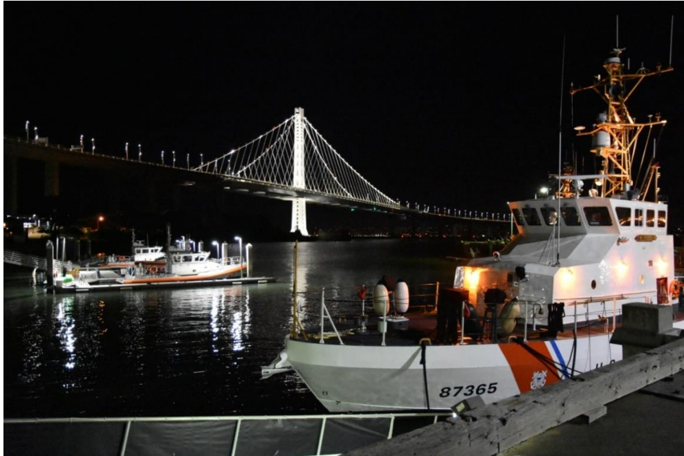
USCG Sector San Francisco 87' USCG Cutter, 45' Patrol Vessels and East Bay Bridge Tower—Yerba Buena, CA, Photo: Roger Bazeley PA/PB USCG-AUX F1-17