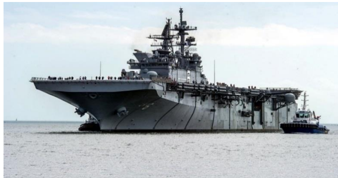
USS America (LHA-6) amphibious assault ship design