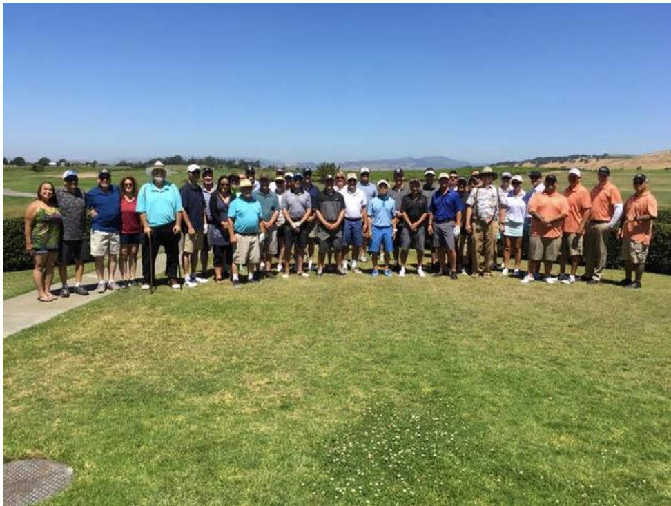
The golf event started with a putting contest with the fewest number of strokes.

On June 30, Division 5 held our second annual Coast Guard Auxiliary Golf Tournament at the Chardonnay Golf Club in Napa California. We had a total of 46 golfers and support that included active duty Coast Guard (11) from CG Station Vallejo, CG Station Rio Vista, DIRAUX, Solano County Sheriff Napa County Sheriff and CG Auxiliary members and guests.