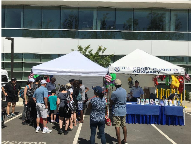
Art and Wind Festival Auxiliary Booth