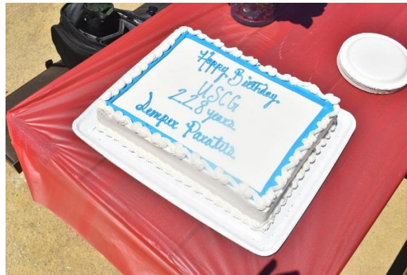
HAPPY BIRTHDAY CAKE