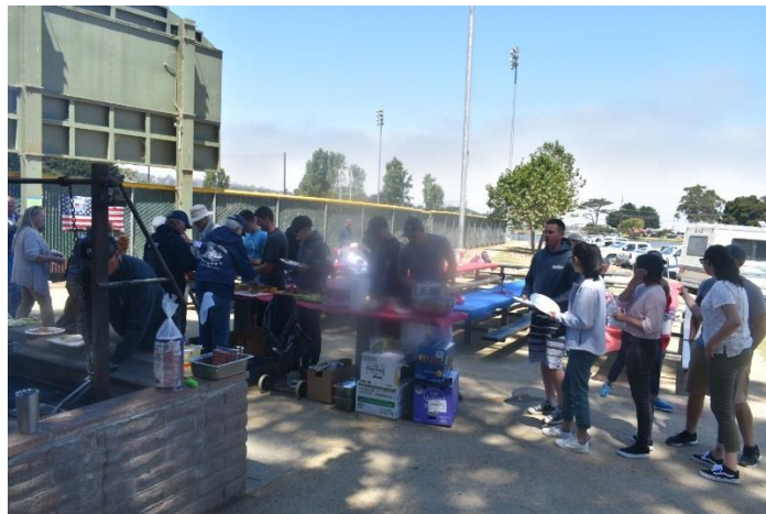
COASTIES & AUXILIARISTS WAITING IN LINE FOR GREAT FOOD