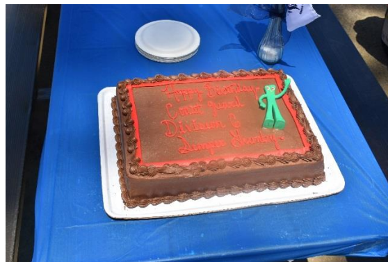
ANOTHER CAKE FOR THOSE THAT LOVE CHOCOLATE