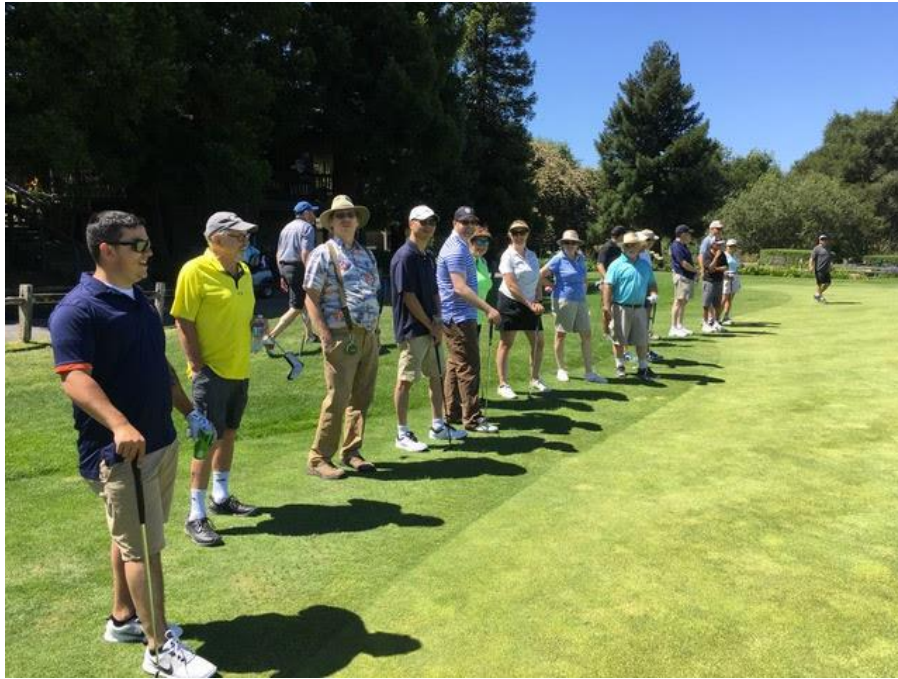
We then raced off for our shotgun start to each of the respective starting holes.