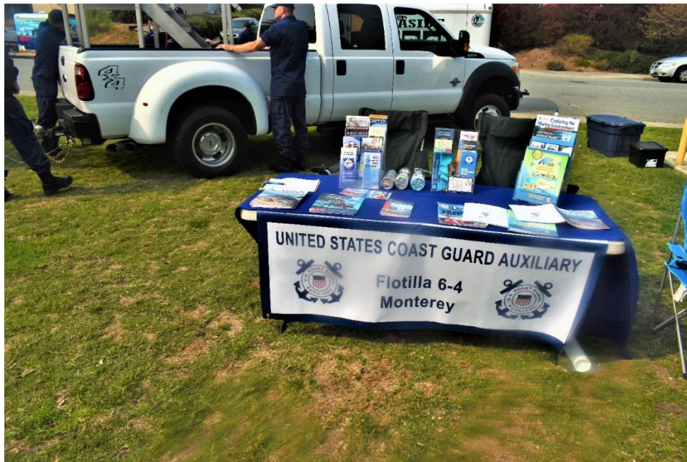
AUXILIARY INFORMATION BOOTH

07 August - Flotilla 06-04 along with active Coast Guard personnel duty participated in First Night Out in Seaside. The 29 Foot RIB was on static display along with a boating safety information booth.