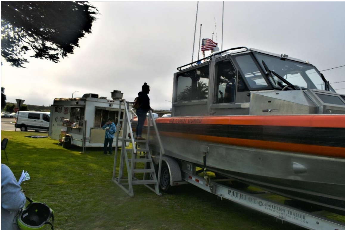
Visitor taking a look at the 29' RBS vessel