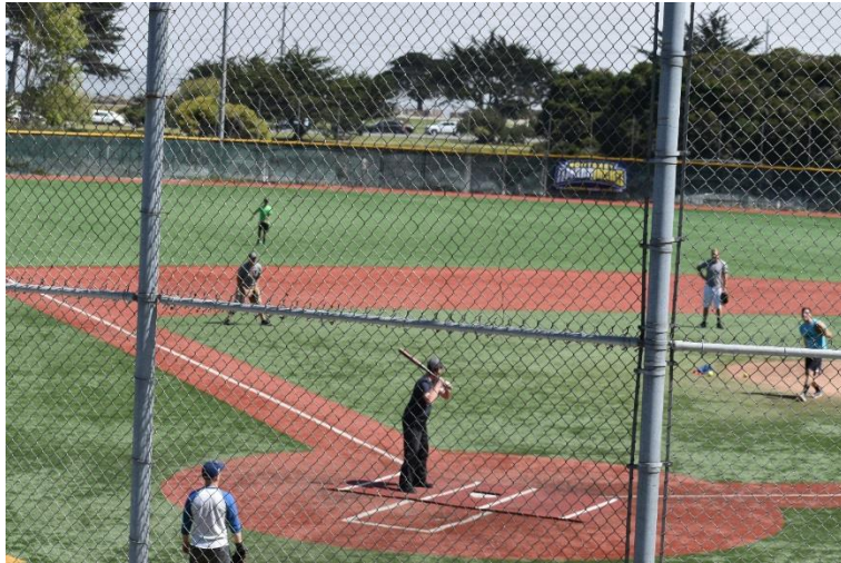
SOFTBALL GAME (BETWEEN STATION AND HAWKSBILL)