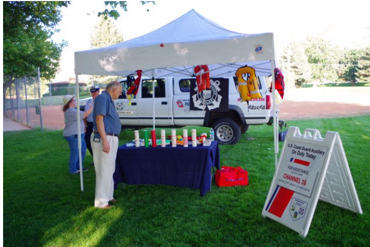
Visitor at the booth