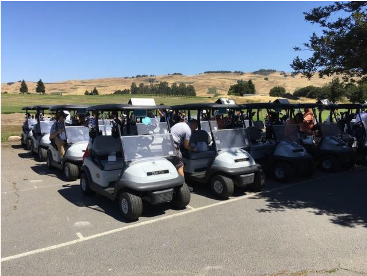
Each team played best ball, and each member needed to contribute their best drive