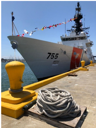
Left USCGC Munro bridge