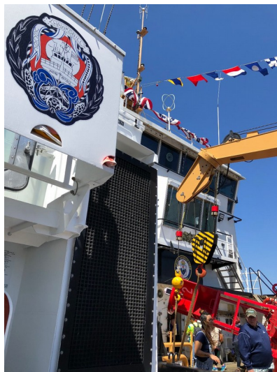
Middle USCGC Hawksbill in Monterey