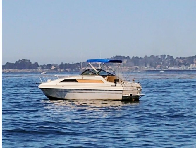
Vessel's name should be “Old Smoky”!

July 2018 was another typical summer season month out of Santa Cruz. On-the-water activities provided a good array of training opportunities along with a few public affairs “moments” and a SAR assist!