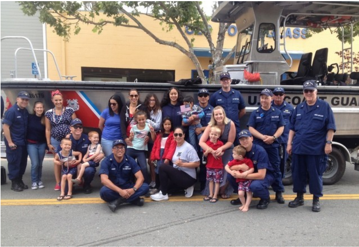
Novato 4 th of July Parade CG Auxiliary members accompanying Pacific Strike Team facilities.