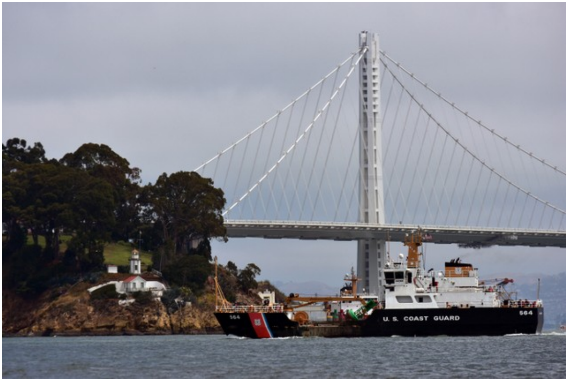
USCGC COBB headed out from Sector SF. Bay Bridge East, 450M from CG Auxiliary Patrol facility CHEERS.

Link BRAVO ZULU 2018 Quarterly 2 NewsMAG https://www.slideshare.net/Roger_Bazeley/bravo-zulu-2018-q2-newsmag-uscgauxfl7-roger-bazeleypublishrmb & all past BRAVO ZULU publications 2017-2018 USCGAUX Flotilla 1-7 Point Bonita Publication-Editor Roger Bazeley FSO-PA, FSO-PB.