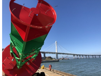
Automated Channel Buoy at TI.