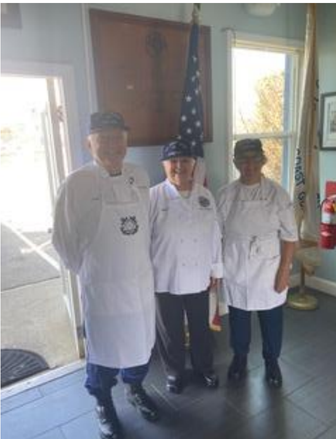
Photo: Div 12 Members and family enjoying great food and company at the Chief's Hut on Coast Guard Island