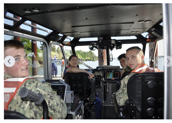
Cadets RBS-29 ride-along