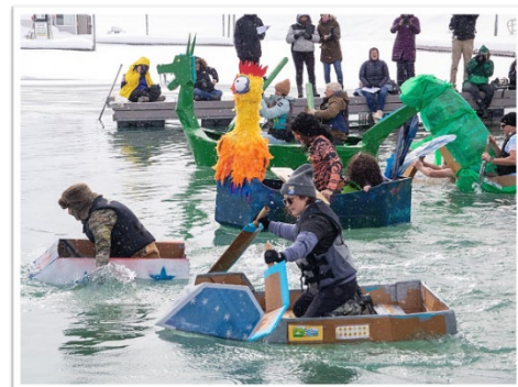
Garden City, UT – Participants and spectators line up for the Cardboard Boat Regatta. Boaters paddled out, rounded the mark, and raced back to shore for the win. January 28, 2023.