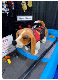
Sandy, Utah - Our show mascot shows off his doggy life jacket. February 9, 2023.