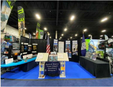
Sandy, Utah - Division 7 booth for 2023 Utah Boat Show at the Mountain America Expo Center. February 9, 2023.