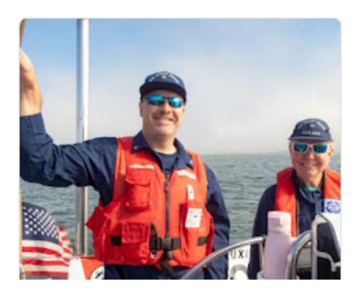
Photo Gallery: (All photos below from Stephen Busch – Fleet Week – San Francisco – 2022 October 7, 8, & 9)