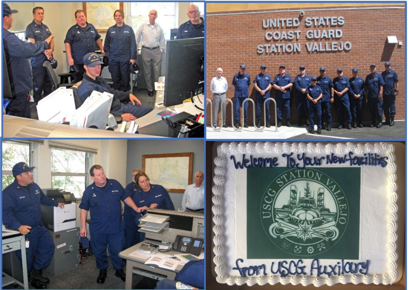
Flotilla 52 Members checking out the new Facility