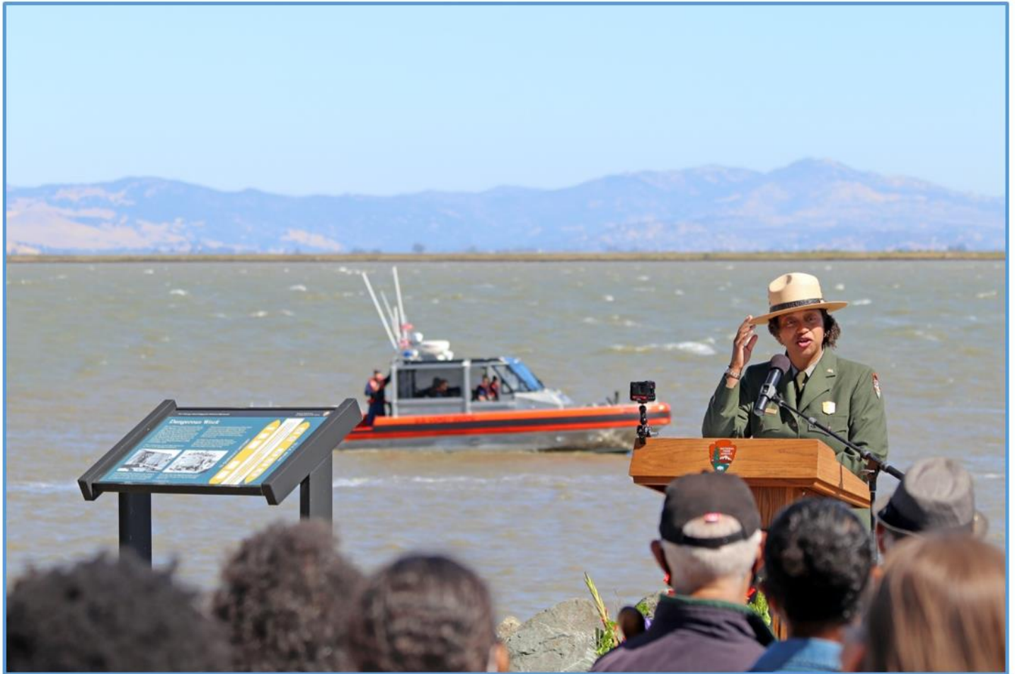
Sta. Vallejo vessel and crew participating in the Port Chicago 1944 Commemoration Event on July 16, 2022