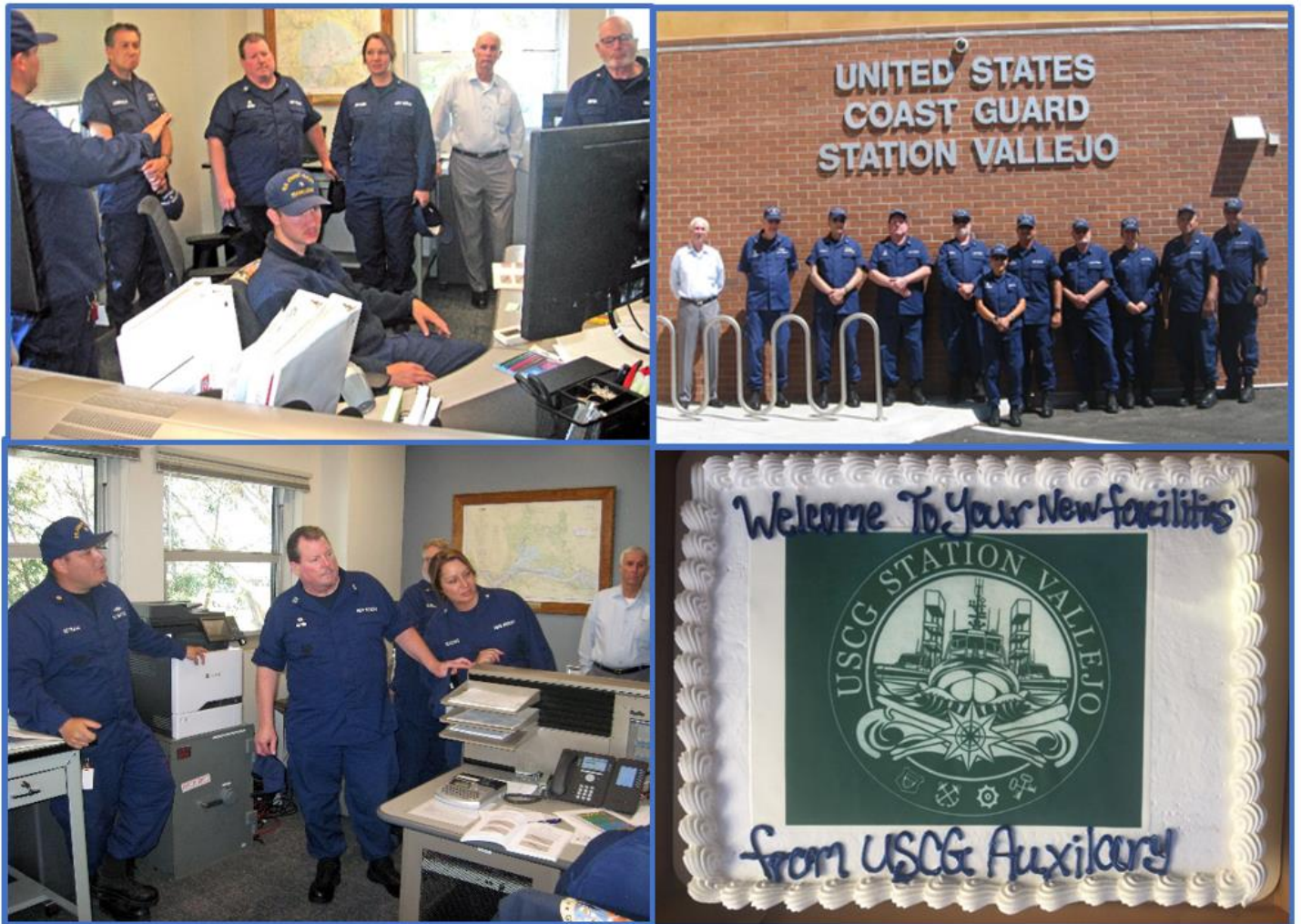
Flotilla 52 Members checking out the new Facility