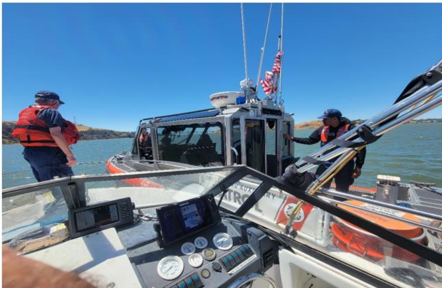
SAR DOG approaches Station Vallejo 29 footer for side tow