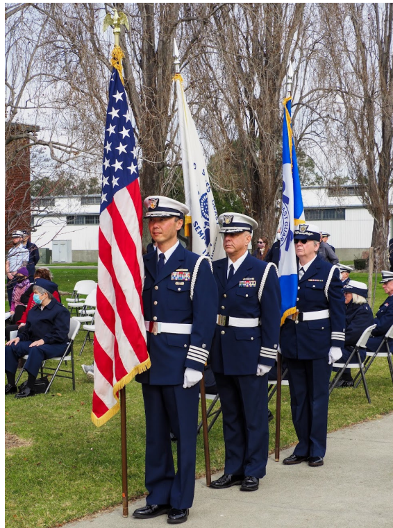
Images from the Auxiliary Memorial Service from 15 JAN 2022.