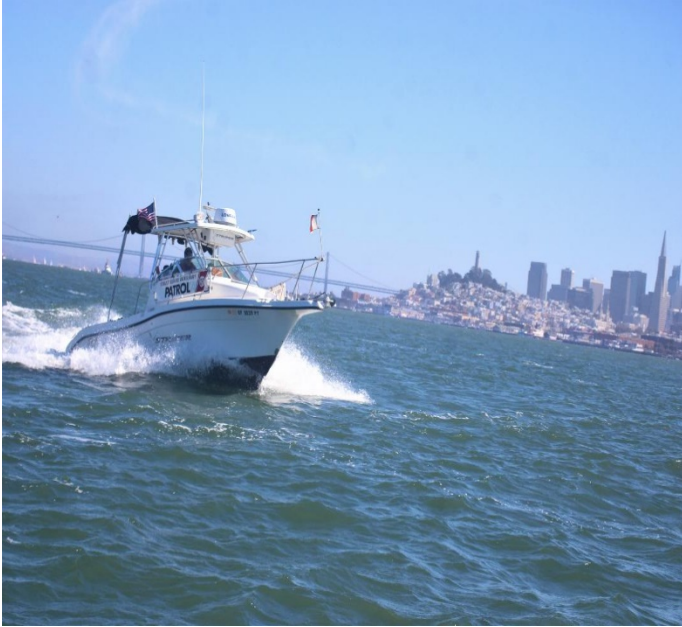
KOKUA II on SF Bay