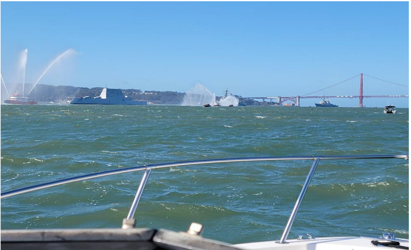
2021 Fleet Week Parade of Ships coming under Golden Gate Bridge