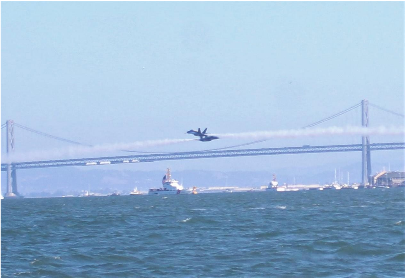
Blue Angles with Bay Bridge in background