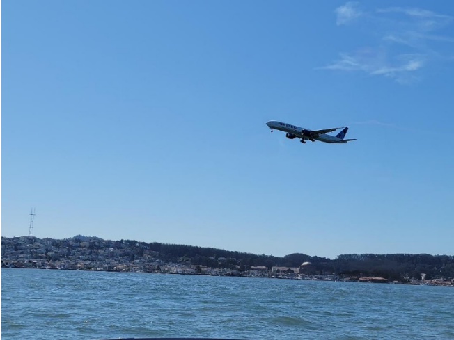
United Airlines 787 Flyover