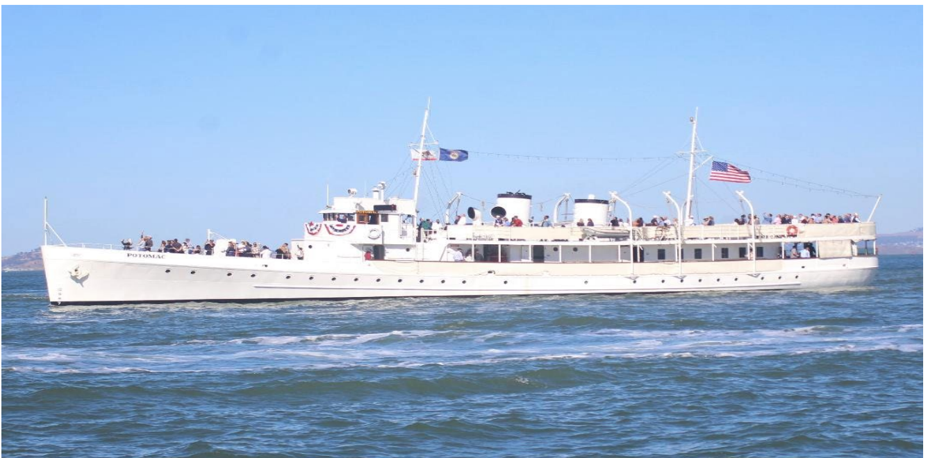
President Roosevelt Ship USS Potomac