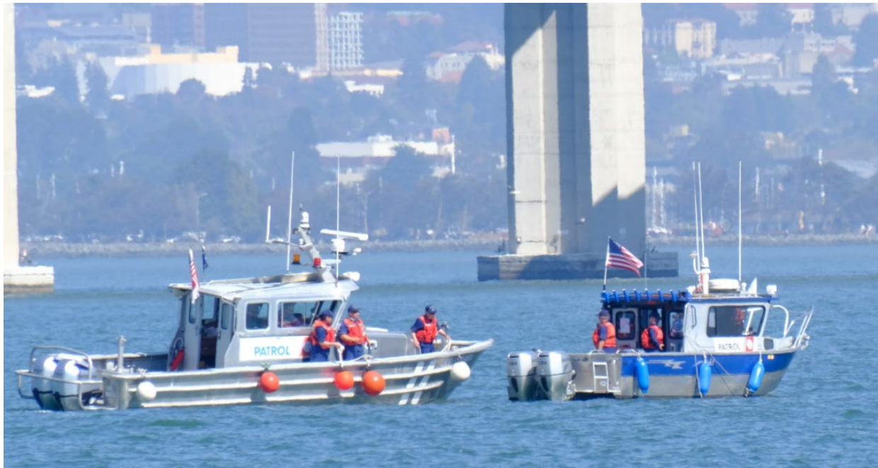
SILVER CHARM and SERVANT set up for a side tow.