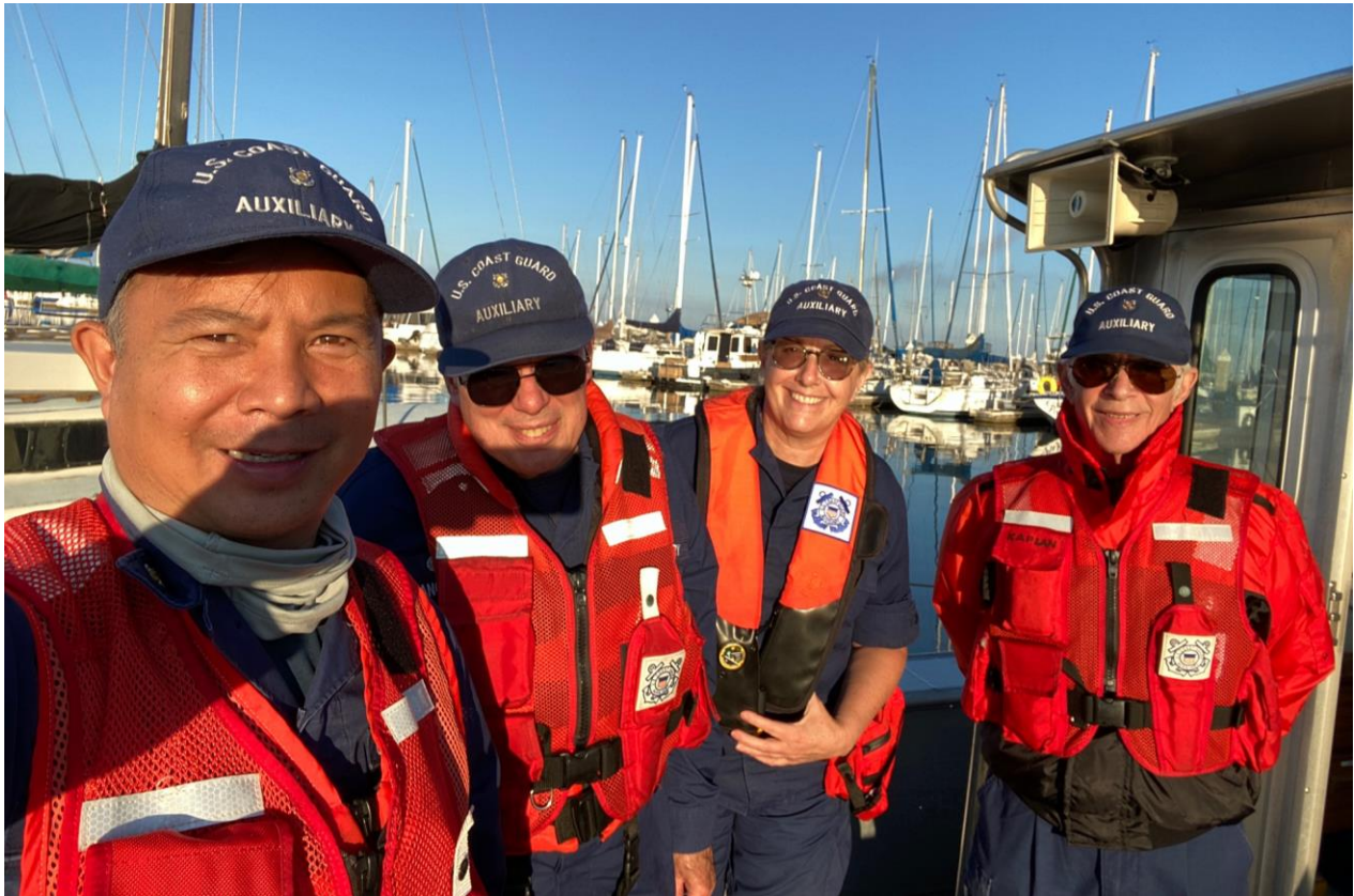
Excerpt from a video of Silver Charm on a patrol on 08 AUG 2021.