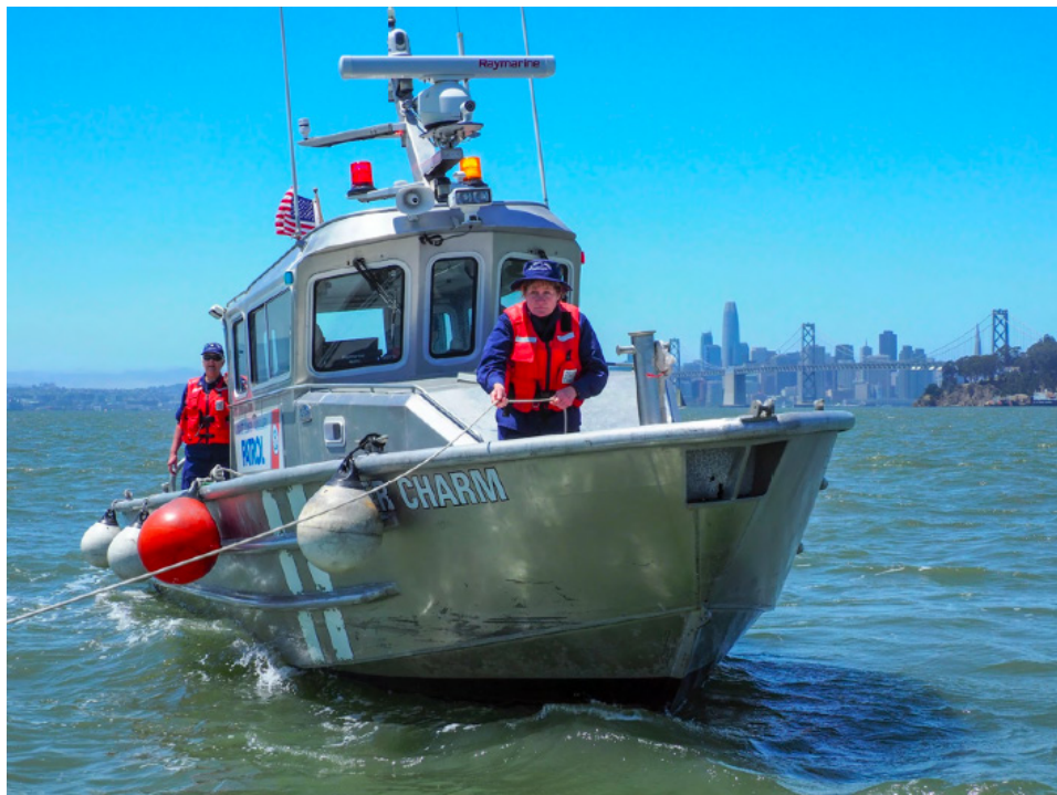
Silver Charm participates in towing evolutions with Servant .