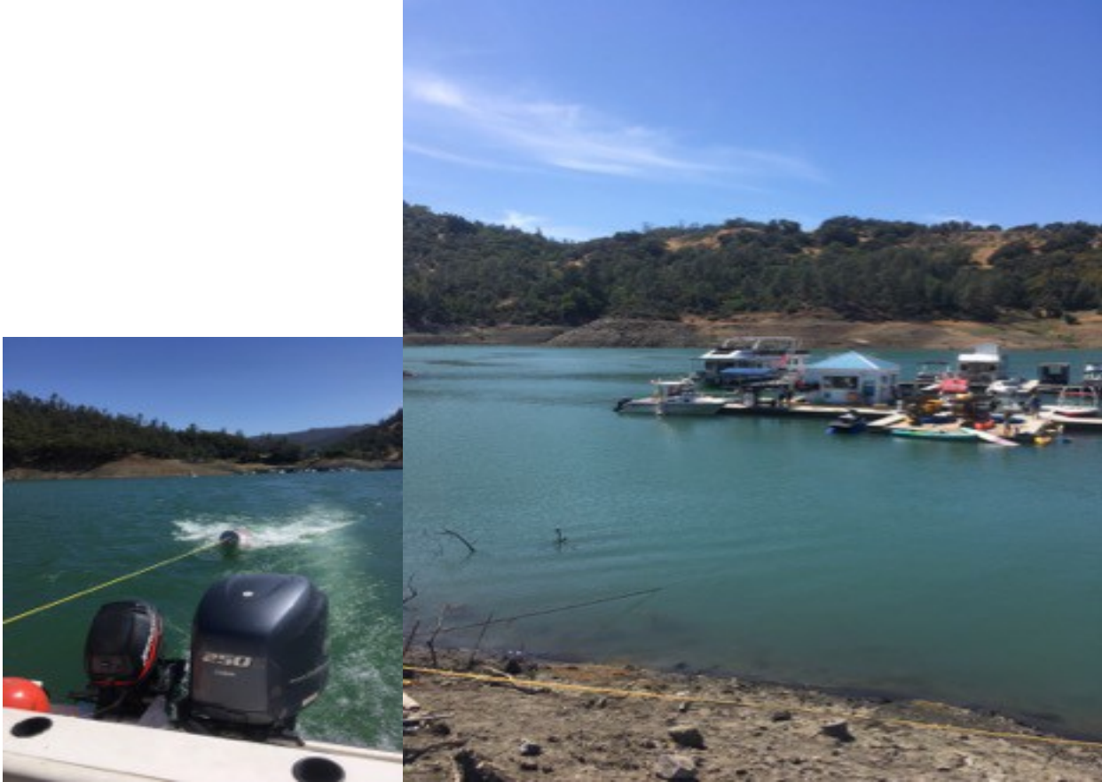
Margarita towing buoy back to Army Corps of Engineers Dock and docked at Lake Sonoma Marina