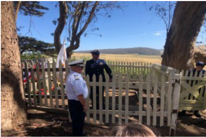
Auxiliarist Wil Sumner and OIC-BMC of Station Bodega Bay Ben Corbisiero