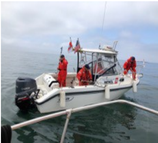
Crew of Margarita hard at work during towing evolutions with Minnow on an unusually calm afternoon on Bodega Bay.