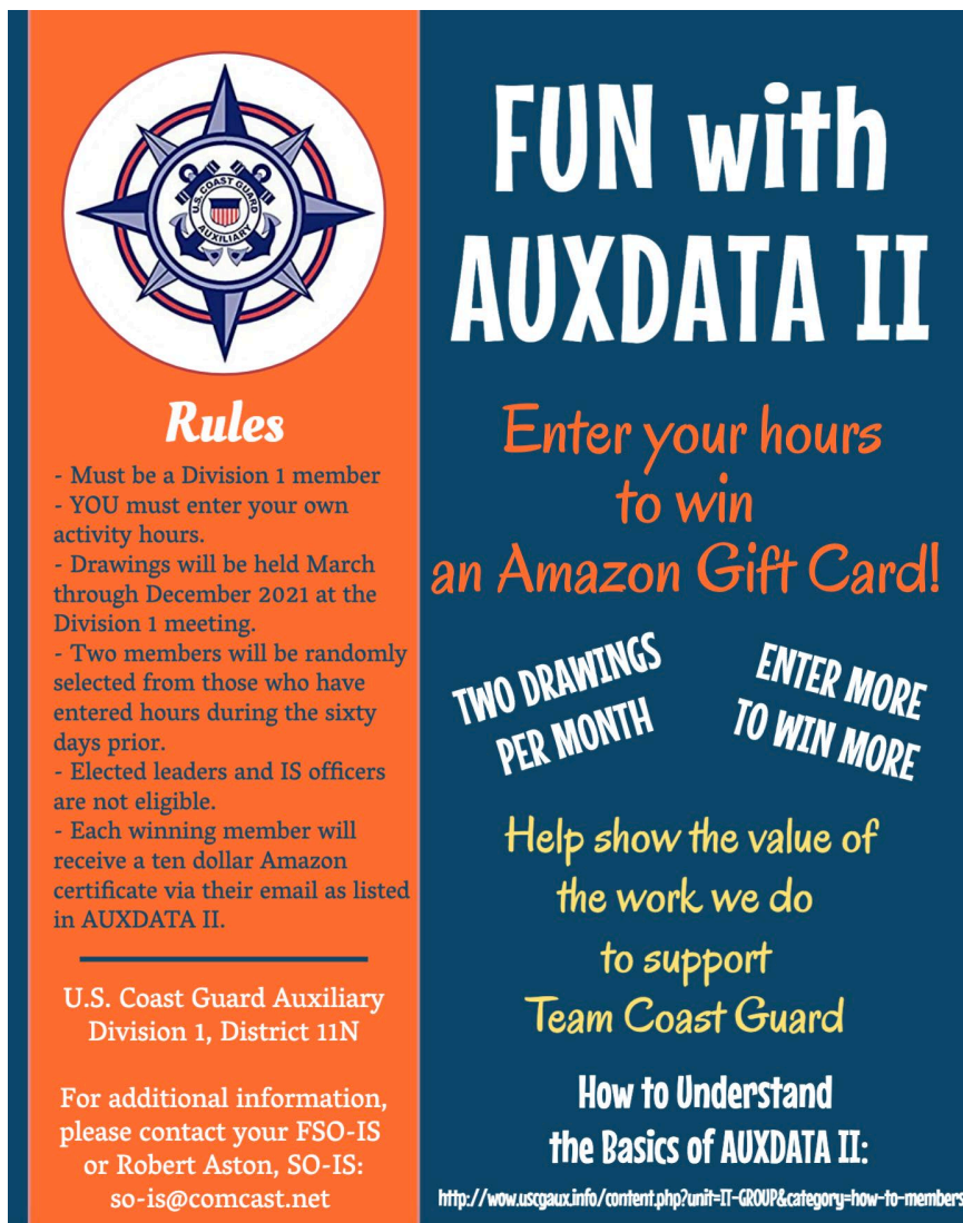
Fun with AUXDATA II flyer