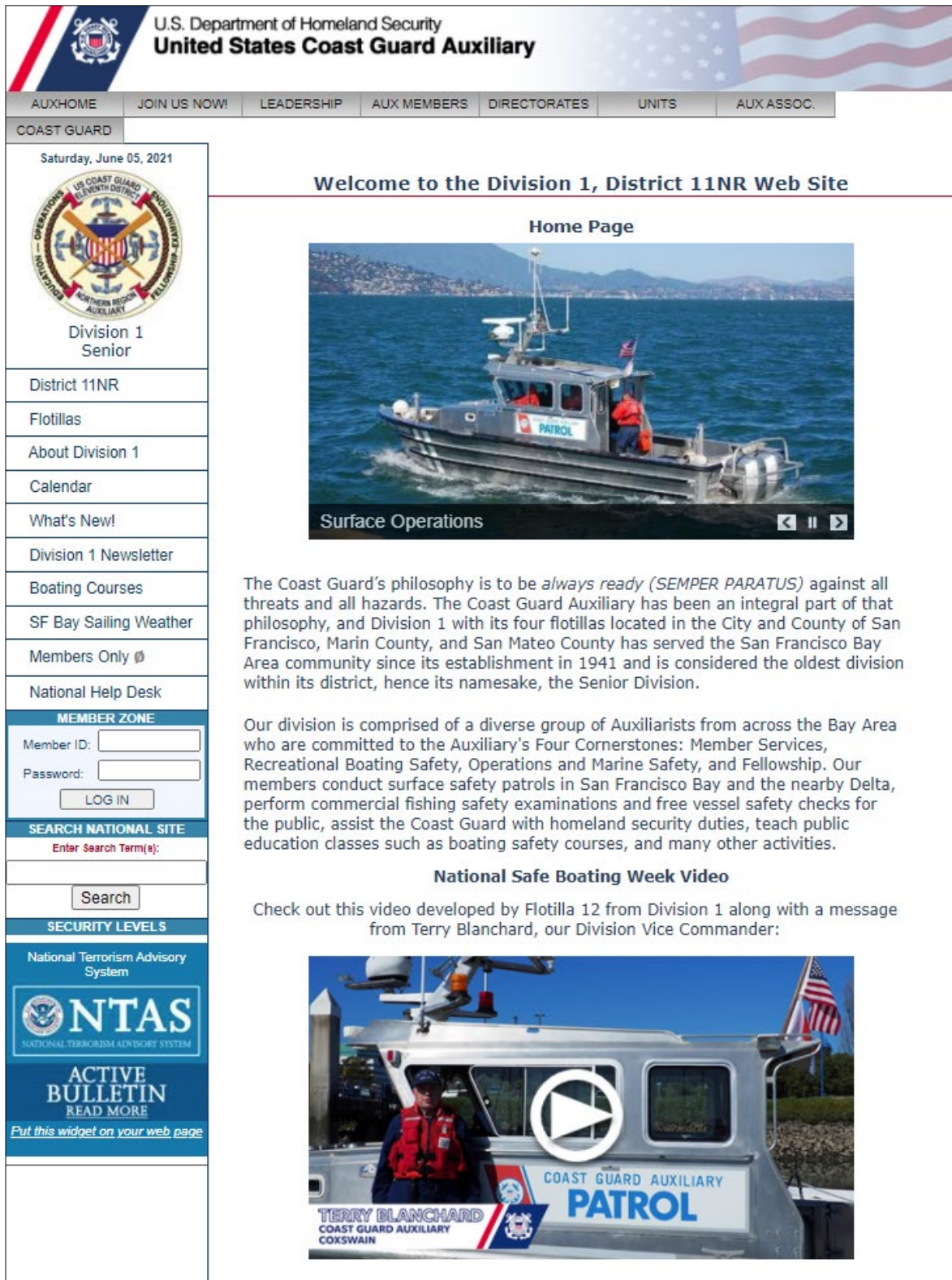
NSBW Video on Division 1 website