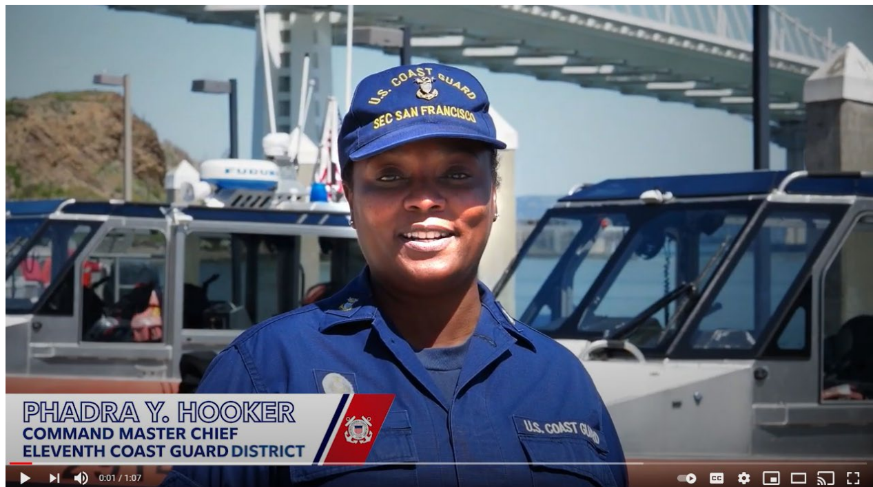
NSBW Video developed by Flotilla 01-02