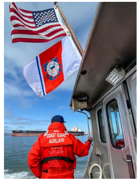
Photos from Boat Crew Qualification Check Rides on Silver Charm on 17 APR 21.