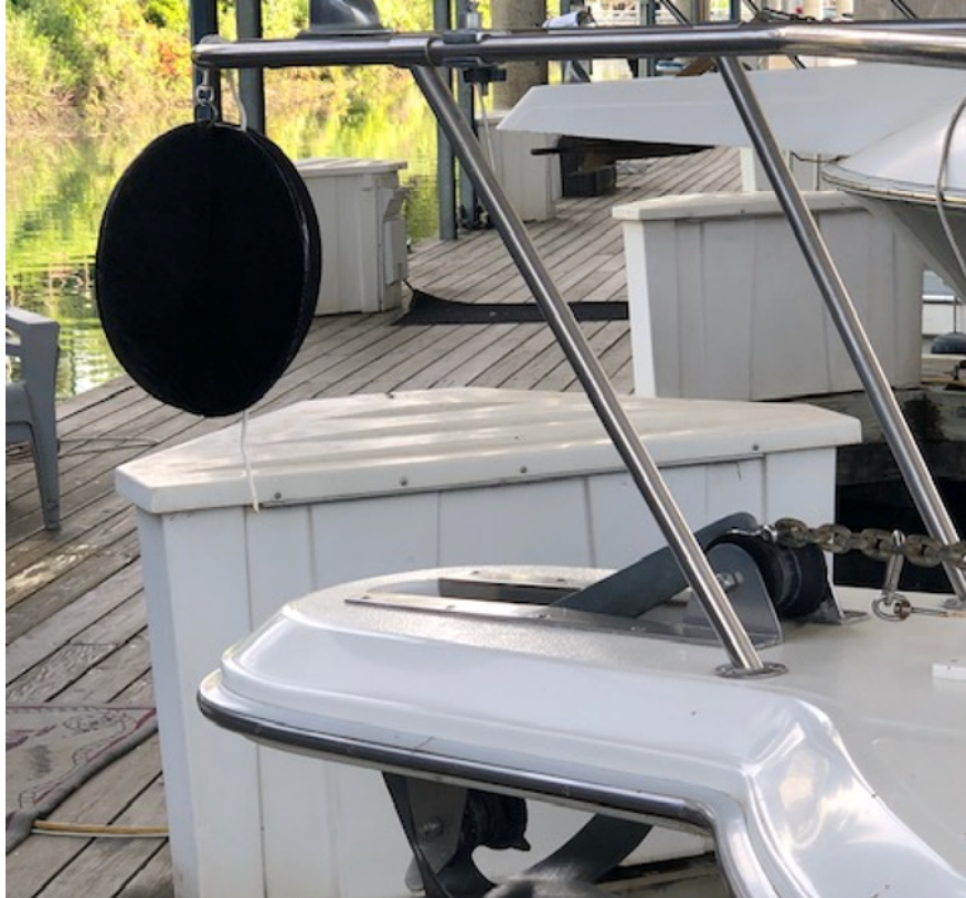
Anchor Ball Deployed