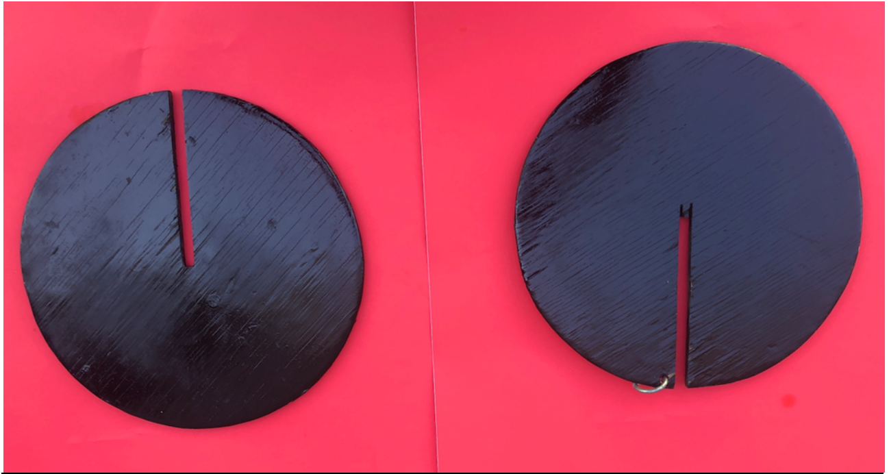
Anchor Ball Ready to Assemble