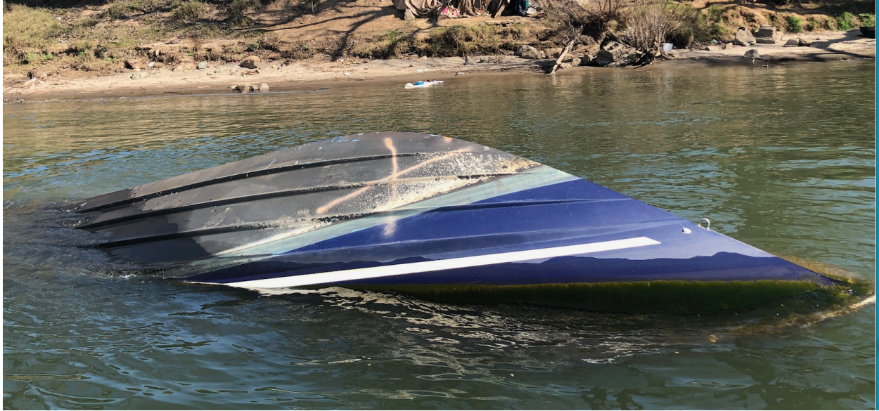
Capsized Vessel Upstream of the I Street Bridge