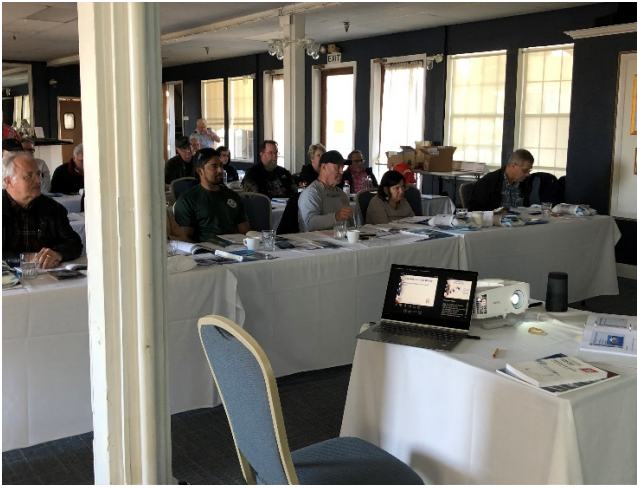
View of Students at ABS Class