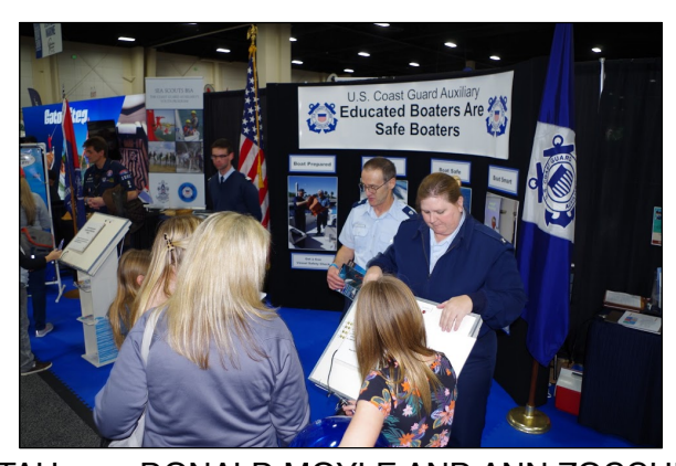
U.S. Coast Guard Auxiliary booth DIVISON 7 UTAH