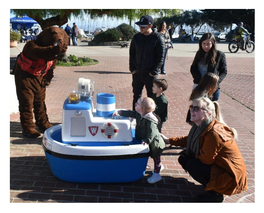
Families meet Auxtter and Coastie at Monterey Whale Fest 2020.