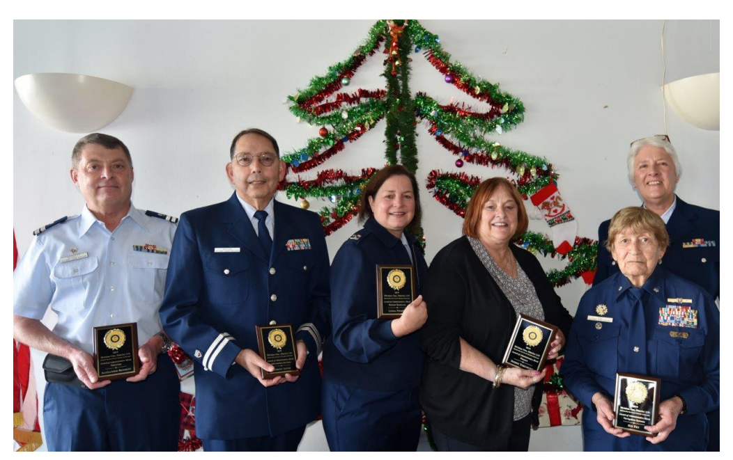
<u>Division 01-Staff Officer Administrative Merit Award Recipients</u>