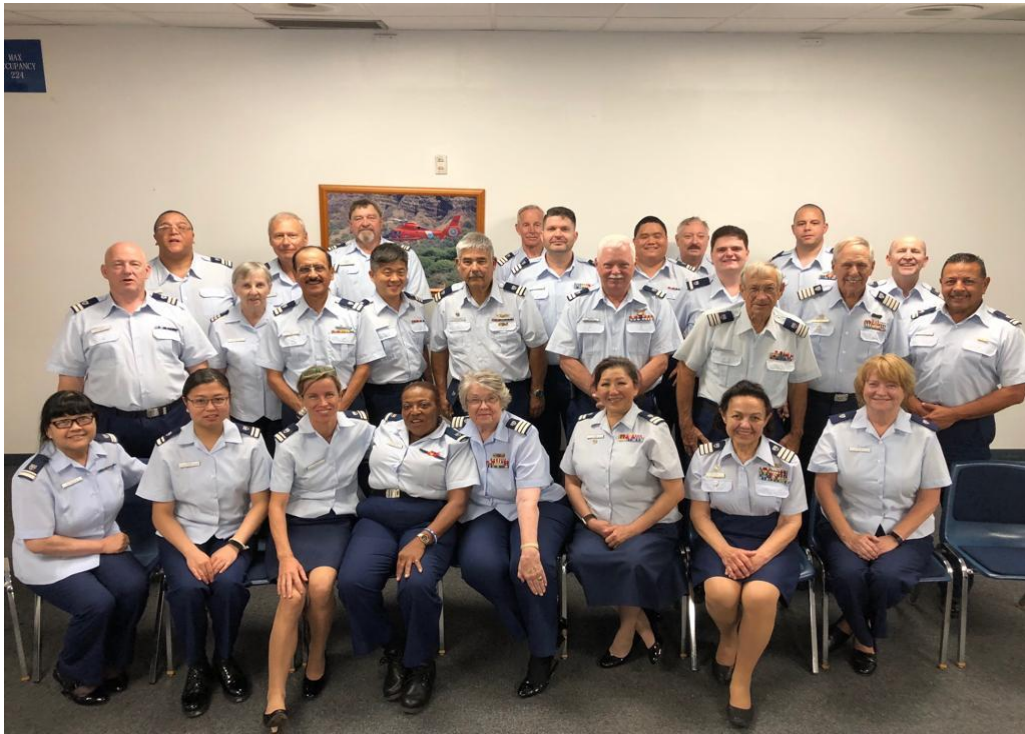
AUXLAMs CLASS at Aloha, Hawaii