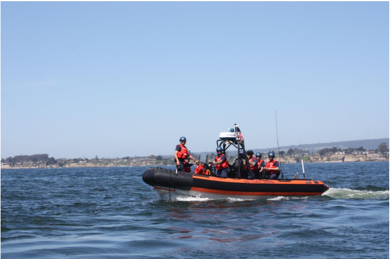
Aspen Small Boat with boarding crew aboard approaches Auxiliary Facility #522