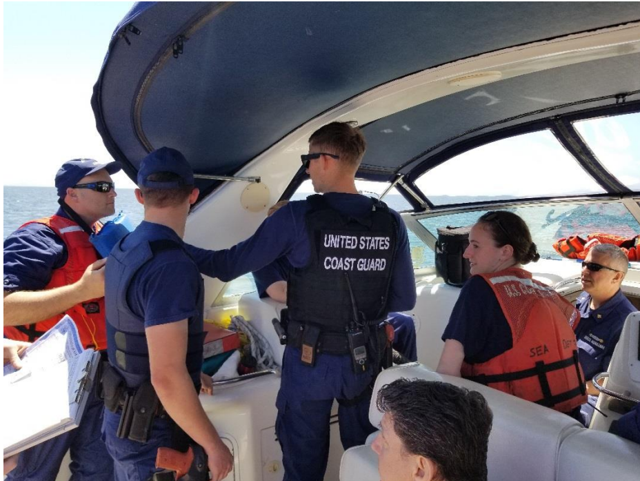
Boarding Crew from Aspen training on Auxiliary Facility #522